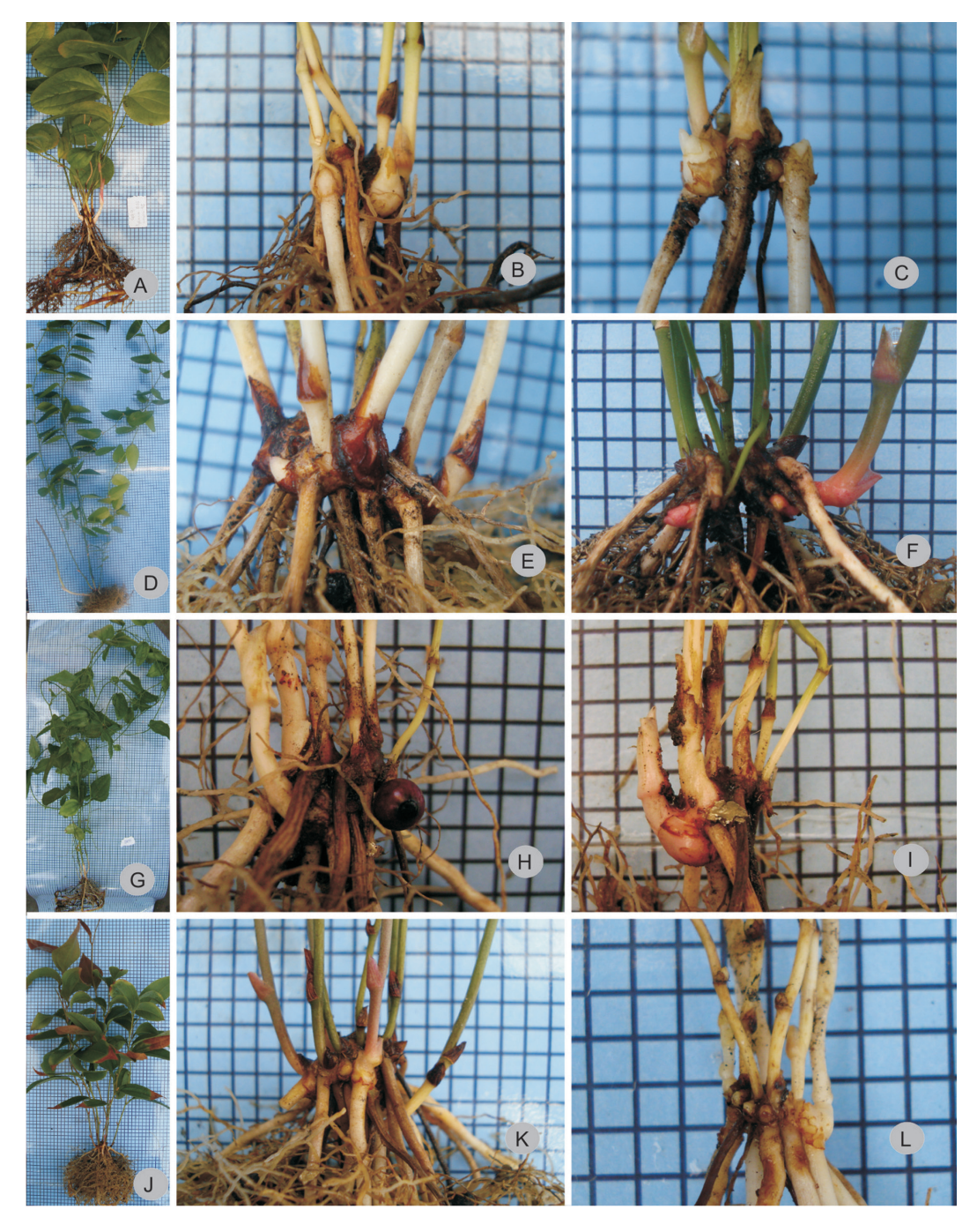
Fig. 3. A.-C. Smilax brasiliensis. D.-F. Smilax campestris. G.-I. Smilax cissoides. J.-L. Smilax polyantha. A., D., G., J. One-year old plant. B.-C., E.-F., H.-I., K.-L. Detail of the new stems development from underground axillary buds. Scale: side of the square is 0.5cm.