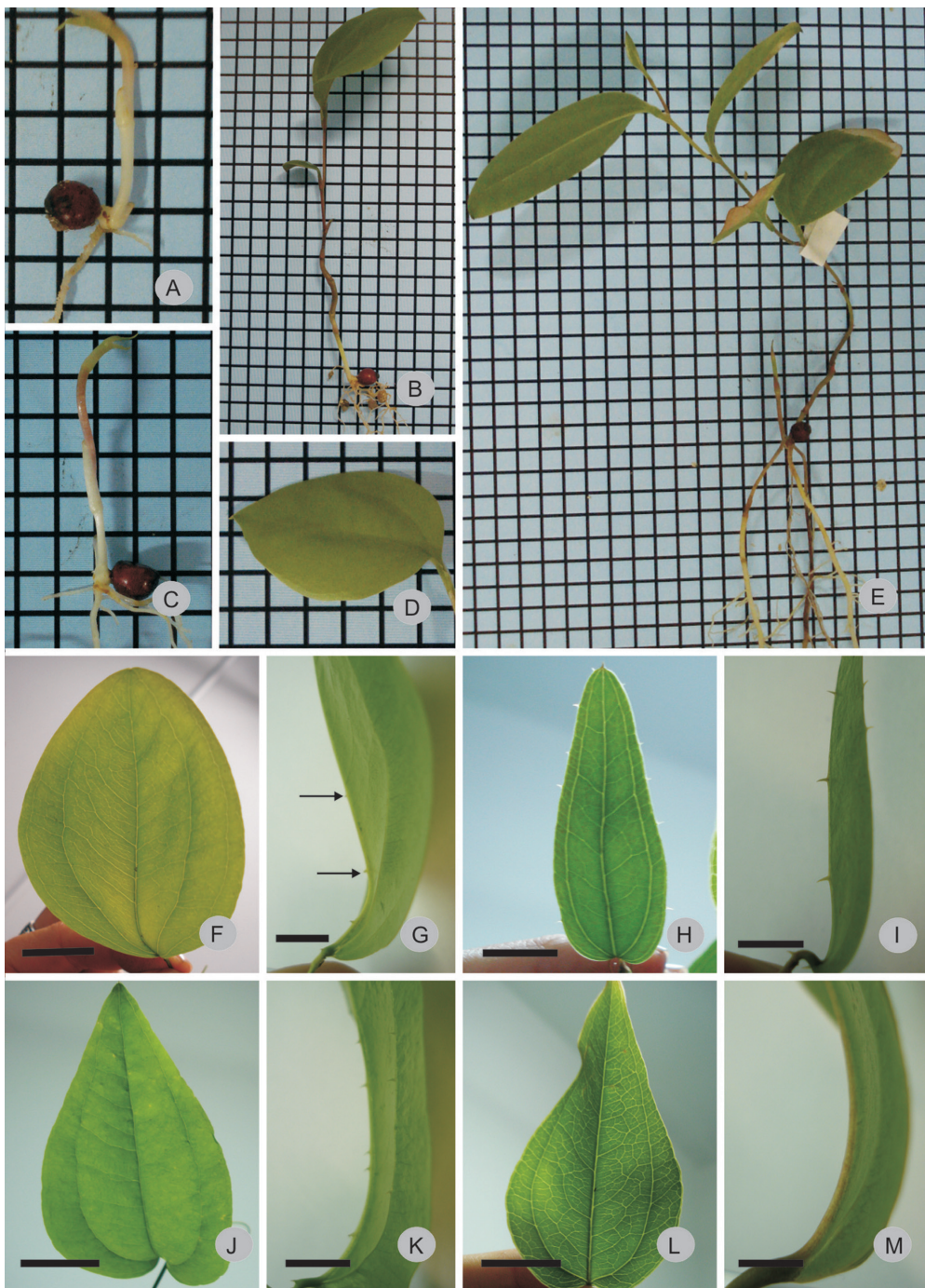
Fig. 2. A.-B., H.-I. Smilax campestris . C.-D., J.-K. Smilax cissoides . E., L.-M. Smilax polyantha . F.-G. Smilax brasiliensis , arrow = prickle-like structures on the midrib. A, C. Early seedling development. B., D. Seedling with eophyll. E. Seedling with the fourth protophyll. F.-M. Leaves of one-year old plants of Smilax . Scale: A.-E. Side of the square is 0.5cm, F., J., L. 2cm. G., H., K., M. 1cm, I. 0.5cm.