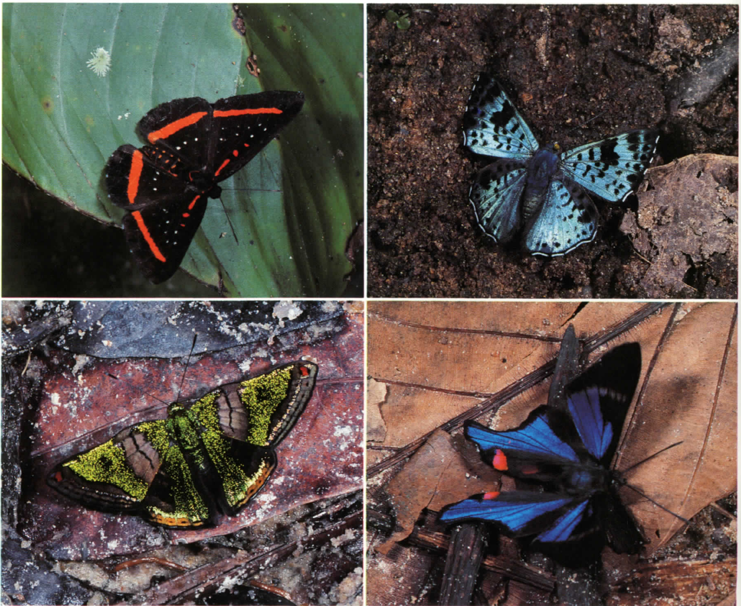
Fig. 18-21. Rondonia Riodininae: 18. Male Amarynthys meneria sunning and perching on a forest leaf (upper left); 19. Caria sp. drinking animal urine on a forest trail (lower left); 20. Lasaia sp. drinking animal urine on a forest trail (upper right); 21. Rhetus sp. drinking human urine on a trail (lower right).