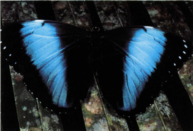
Fig. 3. Interior view of the lush and diverse lowland tropical rain forest at Fazenda Rancho Grande, near Caucalândia, Rondonia.