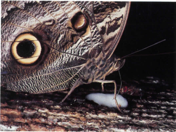
Fig. 13. Caligo brasiliensis (Nymphalidae: Brassoliniinae) feeding at fermenting tree sap.

than 730,000 people. Side roads were built and families were given titles to 250-acre lots of rain forest as long as they cleared half of their plot of land for agriculture. More than 70,000 square miles of Amazonian forest were being burned annually, and a sizeable proportion was located in the state of Rondonia. As the settlers cleared and farmed the rolling hills of this area, the little soil on those hillsides quickly washed away. In order to