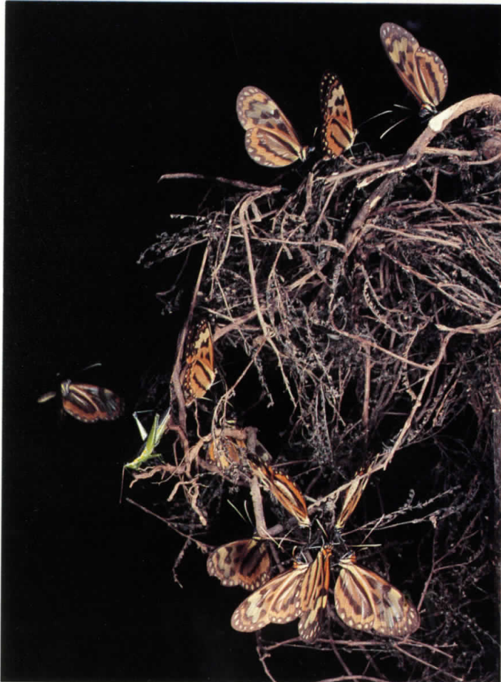
Fig. 14. Hypothyris euclea (Nymphalidae: Ithomiinae) drinking pyrrolizidine alkaloids from the stems of a decaying Heliotropium plant (Boraginaceae).

than 730,000 people. Side roads were built and families were given titles to 250-acre lots of rain forest as long as they cleared half of their plot of land for agriculture. More than 70,000 square miles of Amazonian forest were being burned annually, and a sizeable proportion was located in the state of Rondonia. As the settlers cleared and farmed the rolling hills of this area, the little soil on those hillsides quickly washed away. In order to