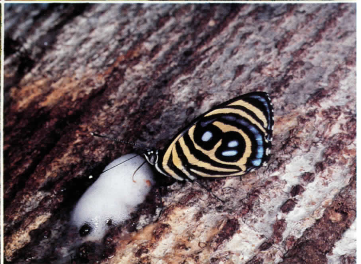
Fig. 7. Hamaeryas sp. (Nymphalidae) feeding at tree sap.