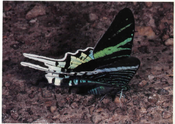
Fig. 15. A diurnal Urania moth (Uraniidae) drinking water at a river bank.

continue farming or obtain useful land for cattle, the settlers had to clear new tracts of land. By 1987, American weather satellite pictures of Rondonia showed Brazilian ecologists that more than 100,000 fires were burning at once in the state during the dry season, and that the rain forest was being cleared at a rate far beyond what anyone had suspected. An urgent worldwide interest immediately developed (e.g., Linden, 1989) in preserving this and other rain forests of the Amazon Basin because of the already alarming extent of global warming being increased by the release of large amounts of CO 2 from the burning of these forests, the role of the forest in the natural oxygen cycle and hydrologic cycles of the western hemisphere itself, and the fact that self-sustainable uses could be made of the rain forests that would be more profitable to Brazil than the past policy of clearing the forest and planting grass for cattle.