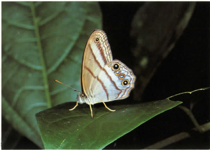
Fig. 16. Euptychia sp. (Nymphalidae) perched on a rain forest leaf.

The area has been sampled for about 10km in all directions around the Fazenda, which lies at latitude 10° 32'S and longitude 62° 48'W. The terrain is typically low rolling hills or flat plains covered with wet tropical rain forest, except in areas of human disturbance.