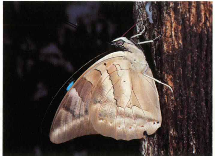
Fig. 6. Prepona sp. (Nymphalidae) feeding at fermenting sap as it oozes from a wound in tree bark.