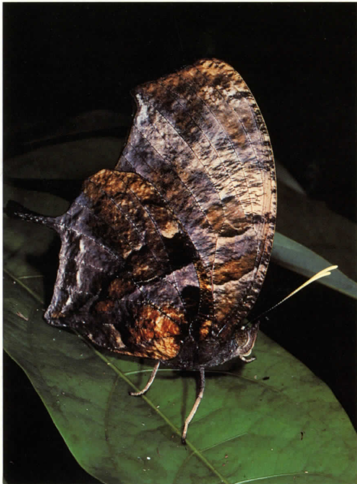
Fig. 17. Consul fabius (Nymphalidae) perched on a rain forest leaf near cow manure, which attracted this butterfly to the ground to feed.

The general elevation in the area ranges from 160-350m; the Fazenda Rancho Grande ranch house is 187m (540ft) above sea level. East-west "C"-numbered roads (e.g., C-20) have been