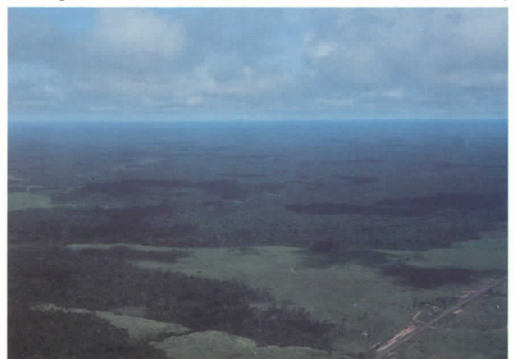
Fig. 2. Aerial view of the Rondonia rain forest (near Porto Velho), showing highway BR364 across the lower right corner and nearby pastures.

The rain forest here was sparsely inhabited by Indians, rubber tappers, and former railroad workers until the then-military regime of the central Brazilian government began pushing the development of the Amazon in the 1960's. Thus in 1966,