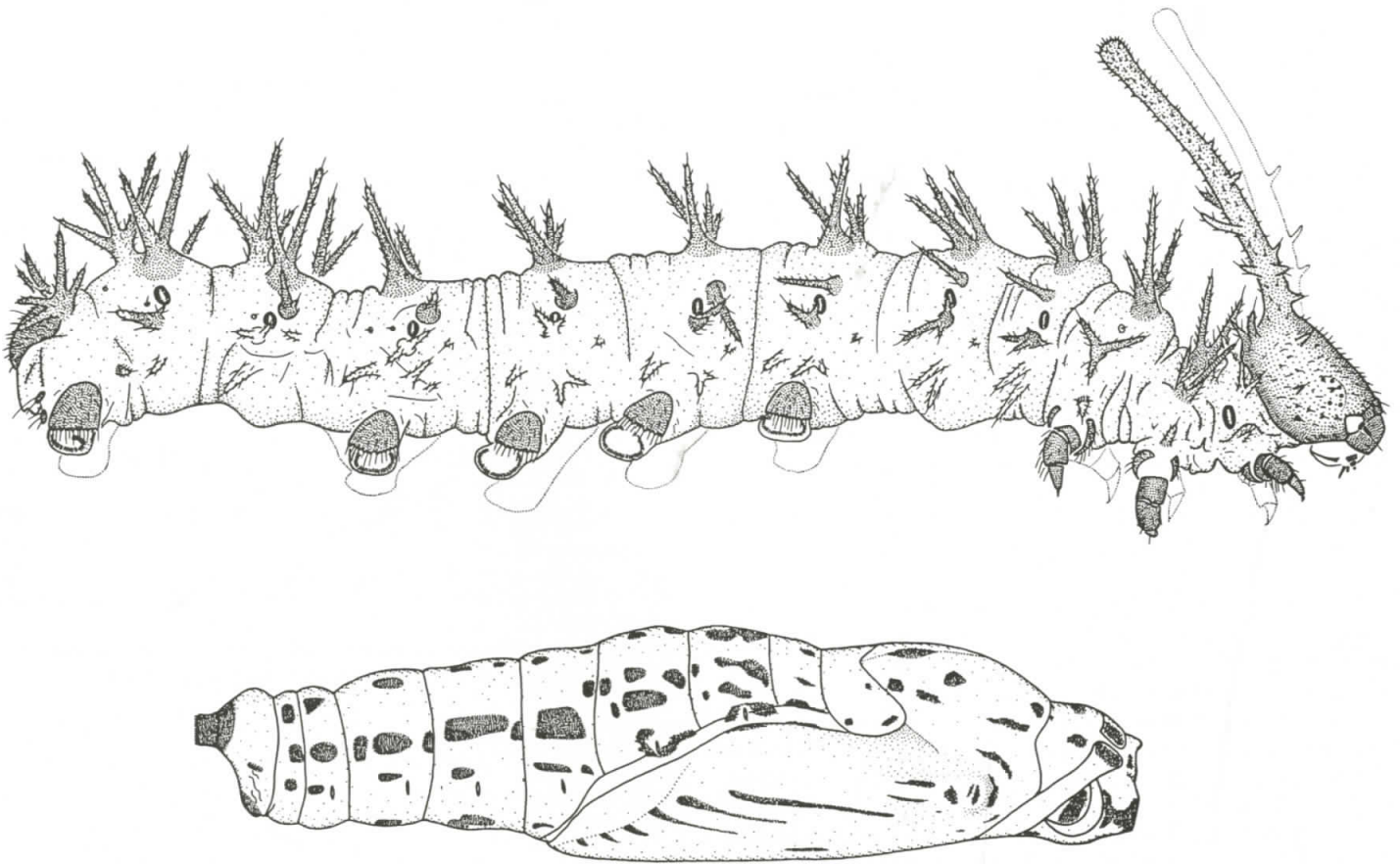
Fig. 2. Batesia hypochlora : mature caterpillar drawn from a preserved specimen (Ecuador, Sucumbios, Garza Cocha, La Selva Lodge and Biological Station, 27 Oct 1993).