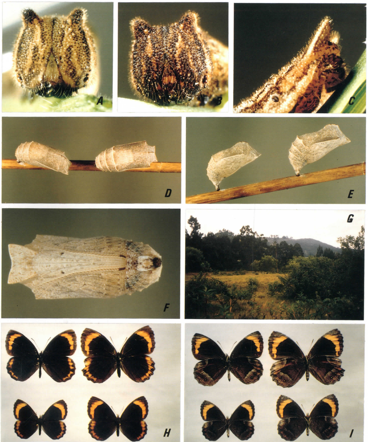
Fig. 2. Life history of Pedaliodes parepa : (A) Head of the fourth instar larva frontal; (B) Head of the fifth instar larva frontal; (C) Caudal part of body with anal tails of the fifth instar larva lateral; (D) Pupae dorsal; (E) Pupae lateral; (F) Pupa ventral; (G) Habitat at Río Tomebamba in the southeast of Cuenca, Azuay-Prov., Ecuador, 2500m, 26 Jan 1996; (H) Imagines dorsal surface: above, left: wild caught male Ecuador, Azuay Prov., Cuenca, 2500m, 26 Jan 1996 (Forewing length 25.5mm), above, right: parent female Ecuador, Azuay Prov., Cuenca, 2500m, 17 Feb 1996 (Forewing length 26mm); below: reared males emerged 24/25 May 1996 in Germany (Forewing length 19mm and 22mm); (I) Imagines ventral surface: same individuals and sequence as in (H).