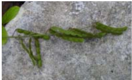
A Desmodium species (D. incanum?) found growing on the slopes of Haleakala, Maui, Hawaii