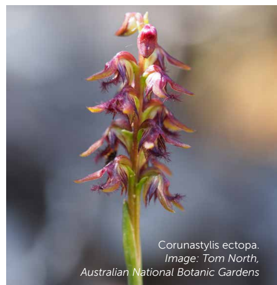
Coronastylis ectopa.

the population size of each taxa has decreased to half the size they were during the baseline year; a TPX value of 1.5 indicates that on average population sizes are 50% above the baseline year.