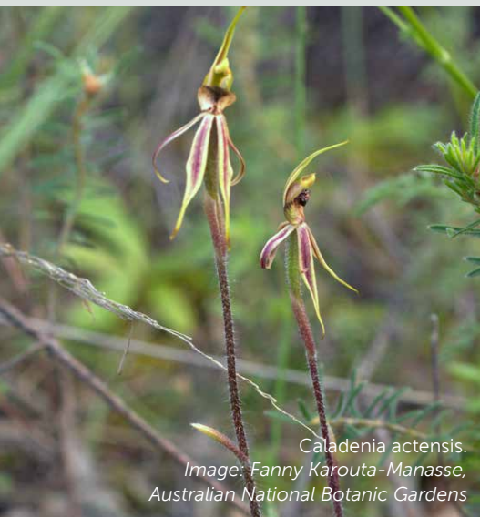
Caladenia actensis .

More data (and species) will be added to the index as they become available each year, increasing the representativeness and robustness of the findings.