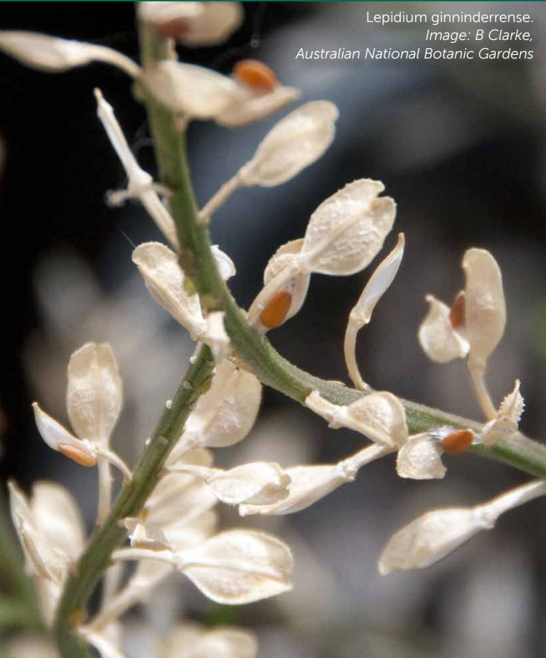
Lepidium ginninderrense .