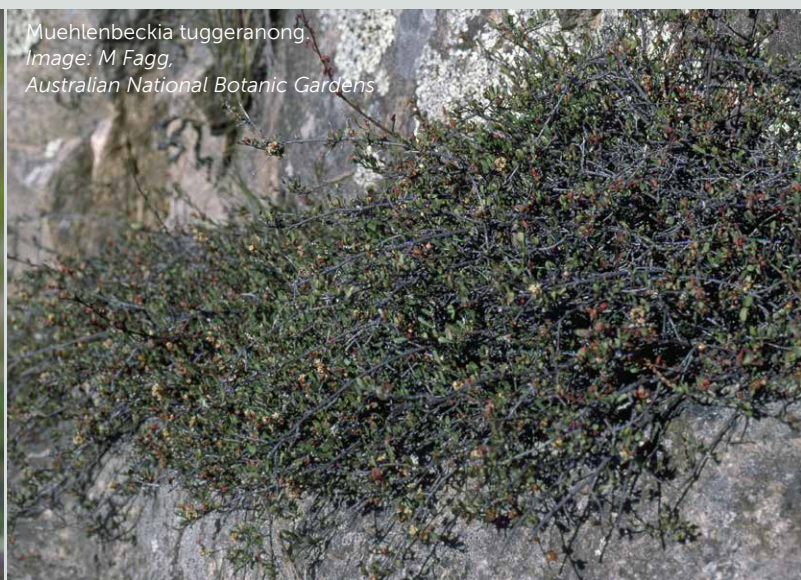
Muehlenbeckia tuggeranong.