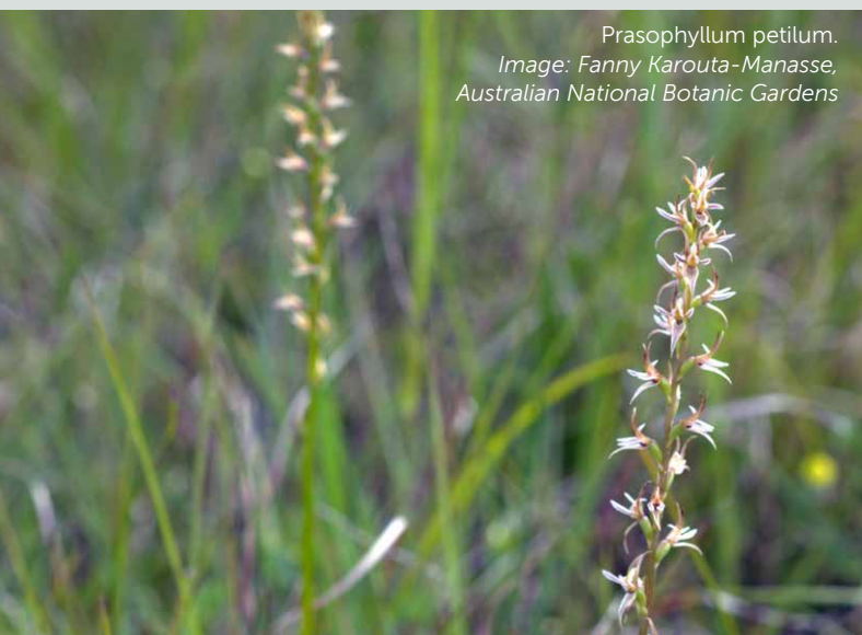
Prasopphyllum petilum.

Note that the species included in the index are not necessarily a representative sample of all threatened species in the Australian Capitol Territory.