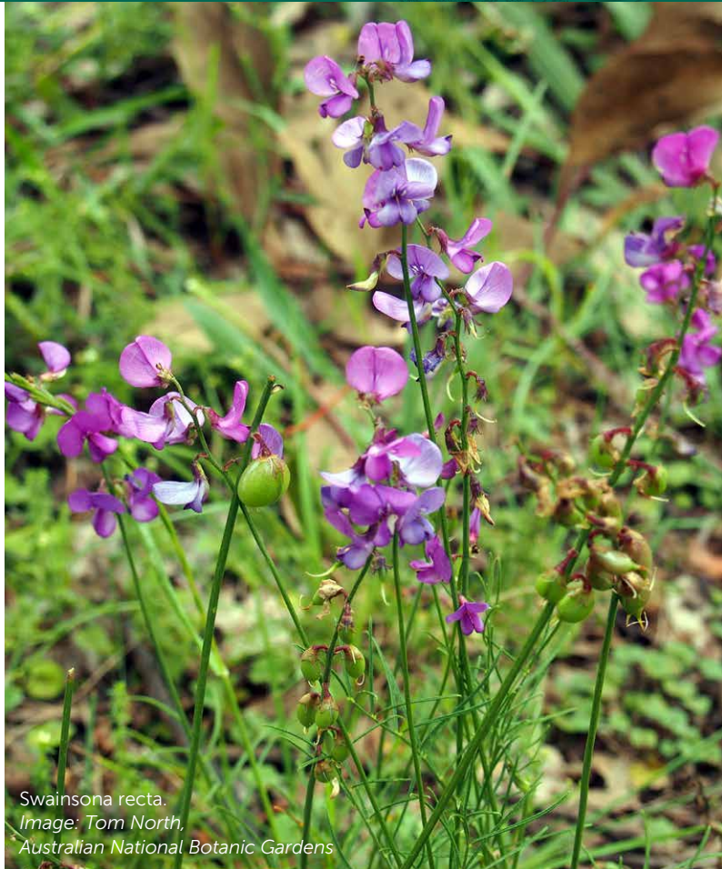
Swainsona recta.