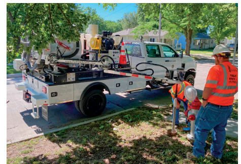
The Standard LX skid can be mounted on trucks from a medium duty flatbed up to a heavy-duty custom service body