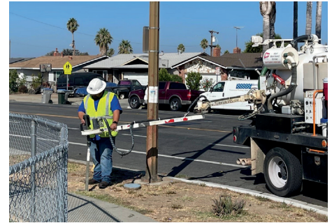
With the ERV-750 extended reach valve exerciser an operator can turn multiple nearby valves without moving the vehicle