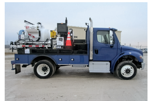
Improve your water distribution system reliability today with a Wachs Valve Maintenance System