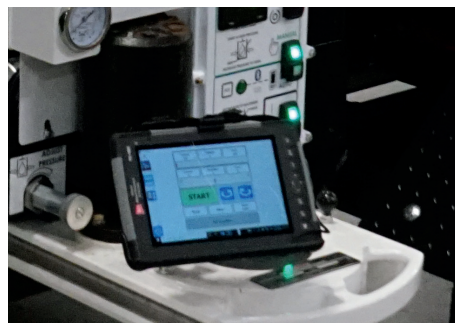
The ruggedized TC-100 handheld computer / wireless controller / datalogger provides intuitive remote exerciser control