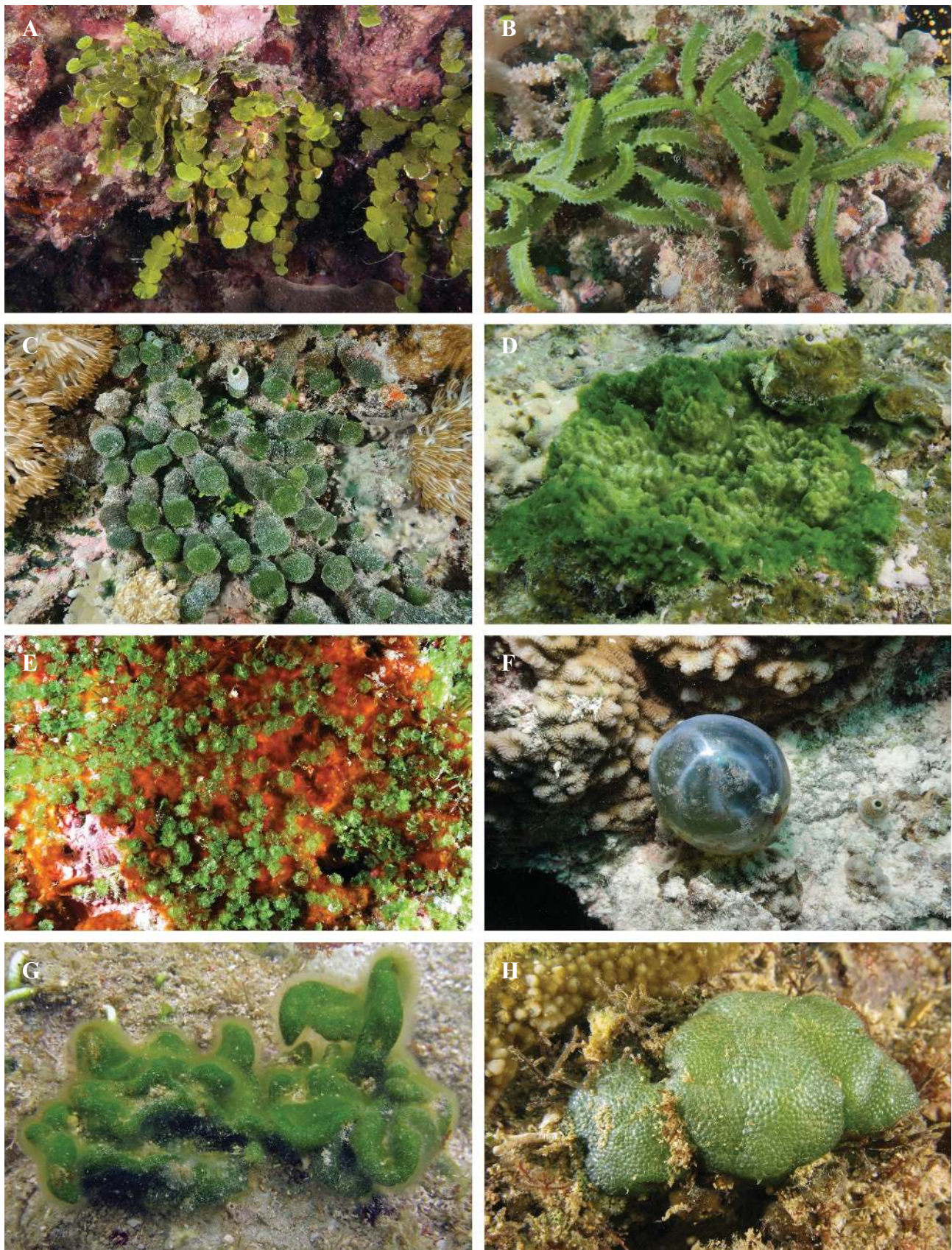
FIGURE 2 Species of green algae from the Kimberley survey area: A) Halimeda minima (Halimedaceae); B) Caulerpa serrulata (Caulerpaceae); C) Tydemania expeditionis (Udoteaceae); D) Cladophoropsis vaucheriiformis (Boodleaceae); E) Caulerpa filicoides (Caulerpaceae); F) Valonia ventricosa (Valoniaceae); G) Codium arabicum (Codiaceae); H) Dictyosphaeria versluysii (Dictyosphaeriaceae).