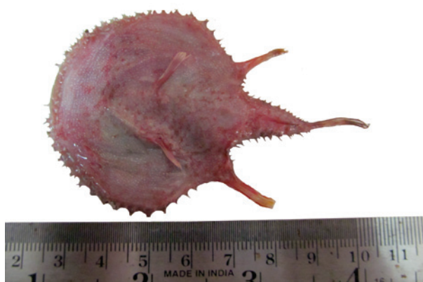
Fig. 2. Ventral profile of Haliutaea indica

Mouth is inferior and broad. Dorsal and anal fin are smaller, pelvic fin present underside of disc and is with well advanced pectorals. The body is uniform brown in colour with pinkish ventral side.