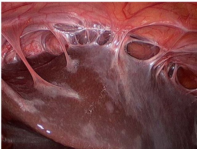
Fig. 2 Celioscopy: “violin string” adhesions, a finding specific for Fitz-Hugh–Curtis syndrome.

A 45-year-old man was admitted for pain in the upper right abdominal quadrant that had been evolving for months. His previous medical history was unremarkable. The physical examination showed a painful and tense abdomen in the right hypochondrium but the rest was pain free. Biological analysis showed an inflammatory syndrome (C-reactive protein 29.54 mg/L). Liver enzymology and urine and blood culture were negative. Abdominal ultrasonography and CT scan (● Fig. 1) showed the presence of fluid in the perihepatic space, the right paracolic gutter, and the Douglas cul-de-sac. Celioscopy (● Fig. 2) showed an inflamed liver parietal peritoneum with “violin string” adhesions, which are specific for Fitz-Hugh–Curtis syndrome [1,2]. A quinolone- and metronidazole-based treatment was administered. The pain resolved partially after the adhesiolysis,