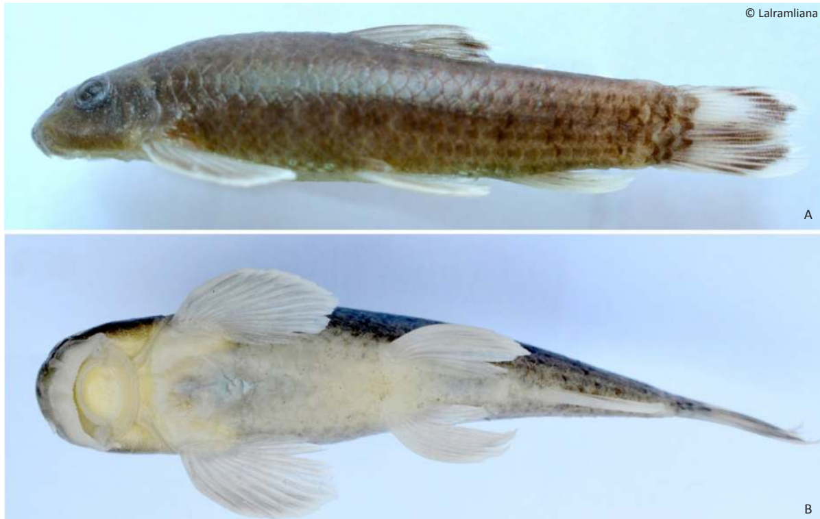
Image 1. Holotype of Garra dampensis sp. nov. (PUCMF 11012), 46.5mm SL (A) Lateral and (B) Ventral view.