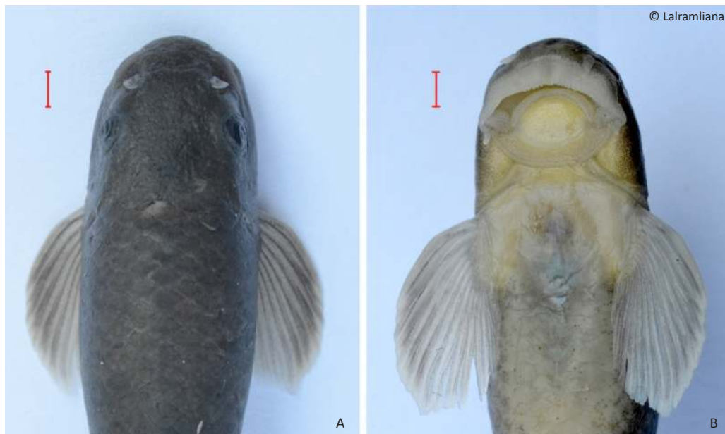
Image 2. Holotype of Garra dampensis sp. nov. (PUCMF 11012), 46.5mm SL Head in (A) Lateral and (B) Ventral view. Scale = 2mm

papilliferous tissue on upper jaw. Antero-lateral fold conspicuous between upper and lower lip at corner of mouth, not extending mediad between exposed lower jaw and lower lip. Lower lip thick and modified into sucking disc. Disc elliptical, wider than long; anterior