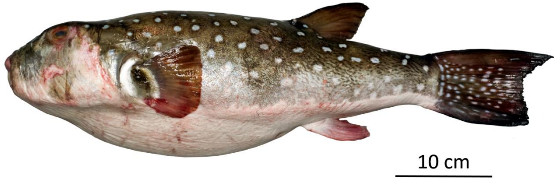
FIGURE 1 Ephippion guttifer caught in the Ría de Vigo, southern Galicia, north-west Spain (570 mm total length).