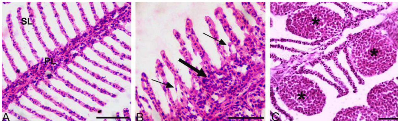
A – General view of gills, presenting primary (PL) and secondary (SL) lamellae with no alterations. B – Lamella exhibiting epithelial lifting (thin arrow) and proliferation of the filament epithelium (thick arrow). C – Aneurysms (*). Hematoxylin-eosin stain. Scale bar = 50 \mu m.