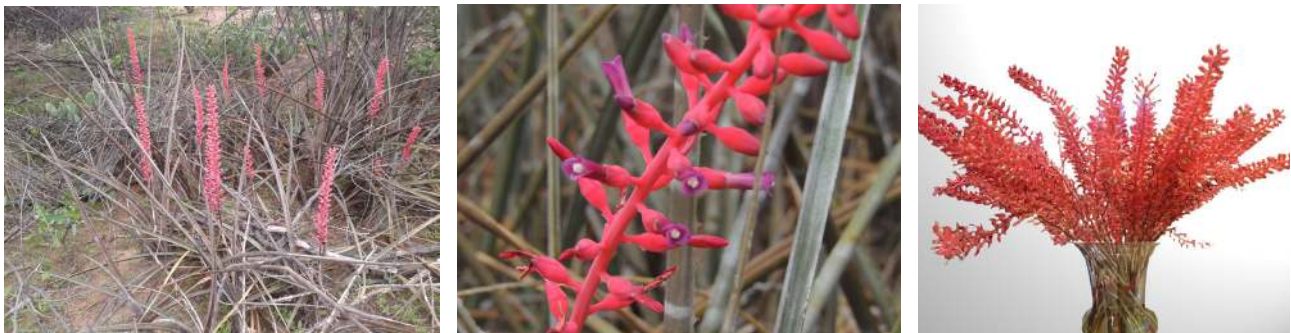
Figure 1. Neoglaziovia variegata (Arruda) Mez (Bromeliaceae). A. Plant habit and details of leaf shape. B. Details of flowers and cut stems. C. Floral composition.

The N. variegata (Figure 1) species belongs to the family Bromeliaceae, endemic of the Caatinga biome, being widely distributed in the Northeastern States of Brazil and part of Minas Gerais (PEREIRA and QUIRINO, 2008). Despite the evident beauty of N. variegata flower stems, whose inflorescence has reddish scape (CMYK 10-100-50-0) measuring approximately 50 cm in height with small flowers of reddish calice and lilac corolla (CMYK 80-100-30-0), this species is still little studied and explored for its potential ornamental (CAVALCANTE et al., 2017). This specie is commonly known by the Brazilian Northeastern population as “caroá” and is more approached in the academic environment owing to its leaves used in fiber extraction (PAULA and GUARÇONI, 2007; ALMEIDA et al., 2008; SILVEIRA et al., 2009; SILVEIRA et al., 2013). The inflorescences stems are emitted in the transition period between the end of the drought season and the beginning of the rainy season (PEREIRA and QUIRINO, 2008).