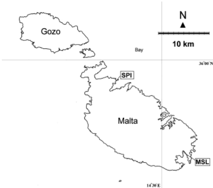
Fig. 1 — Geographic location of the two sampled sites cited in this study.

A checklist of Mollusca was drawn up for two coastal locations (Fig. 1) on the island of Malta – St. Pauls Island (= Selmunett Island; 35°57'57.64"N,