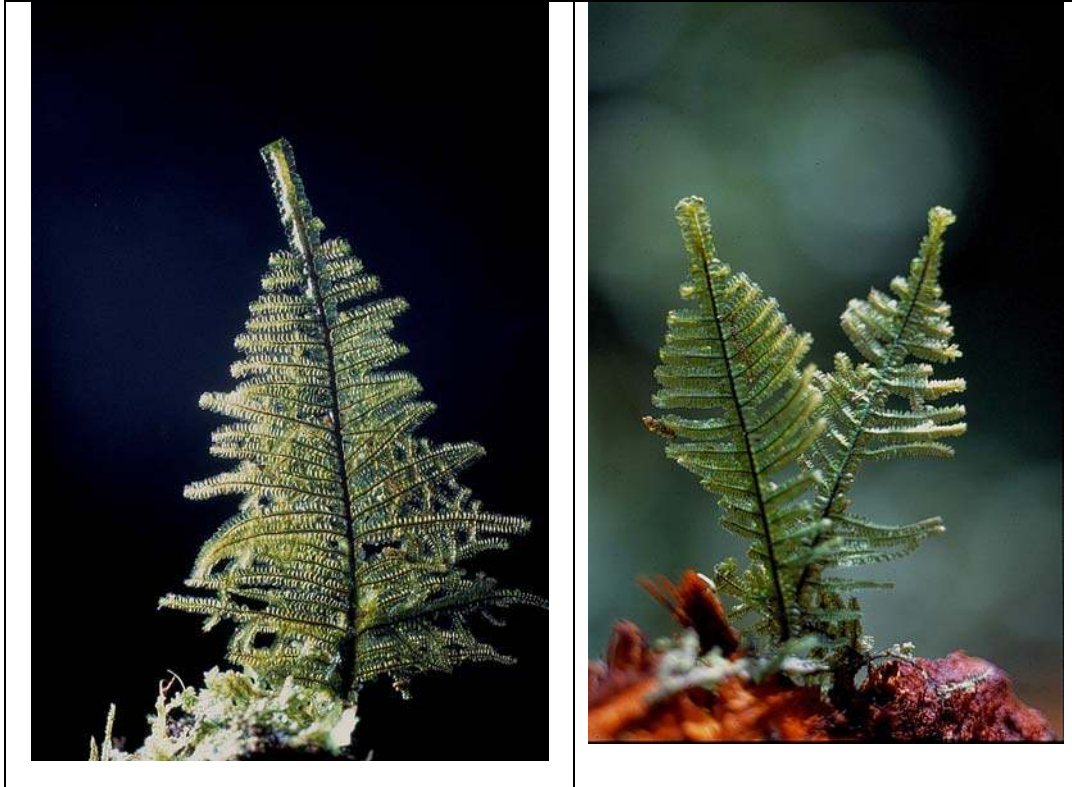
13. The liverwort Fulfordianthus pterobryoides is one of the 4 liverwort species known to be endemic to the Chocó regions. It grows on twigs of treelets in the understory.