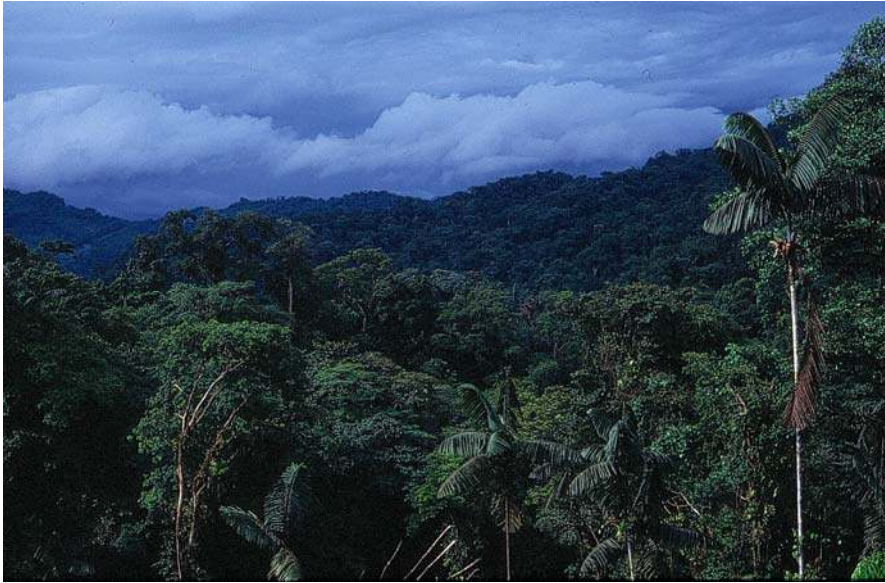
3. Pacific slope of the Andes of the Chocó region.