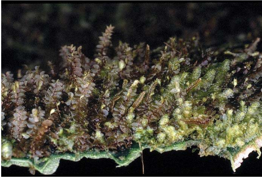
7. Epiphyllous liverworts growing on a leaf in the understory of the Chocó rainforest. The surface of the leaf is densely covered with liverworts as seen from aside. Whereas epiphyllous liverworts usually grow prostrate on the leaves, the liverworts in the Chocó region grow upright because of the high humidity.