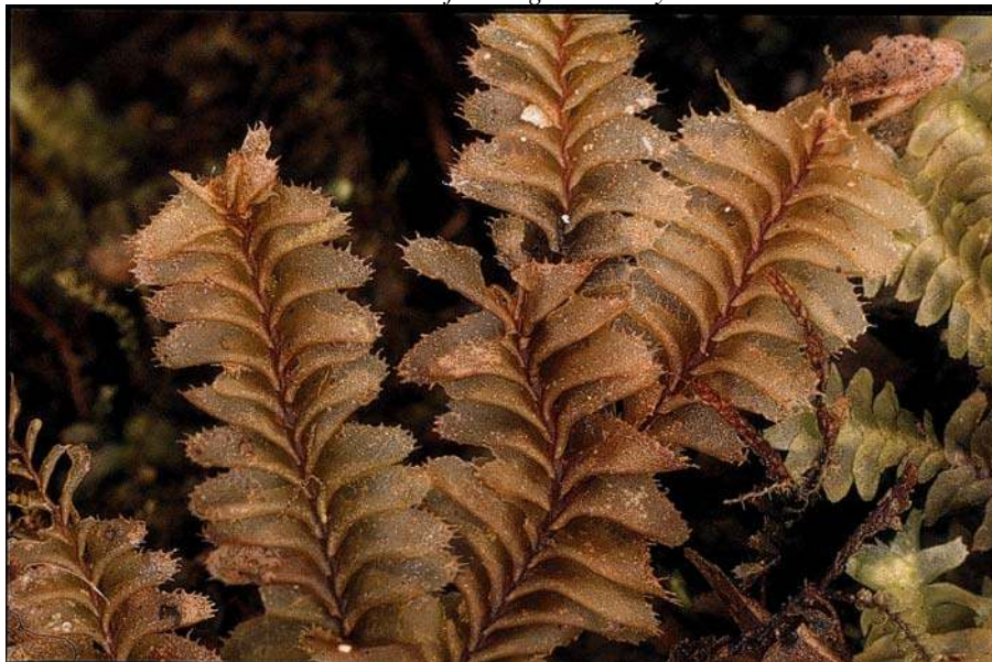
8. A species of Plagiochila with brownish tinge.