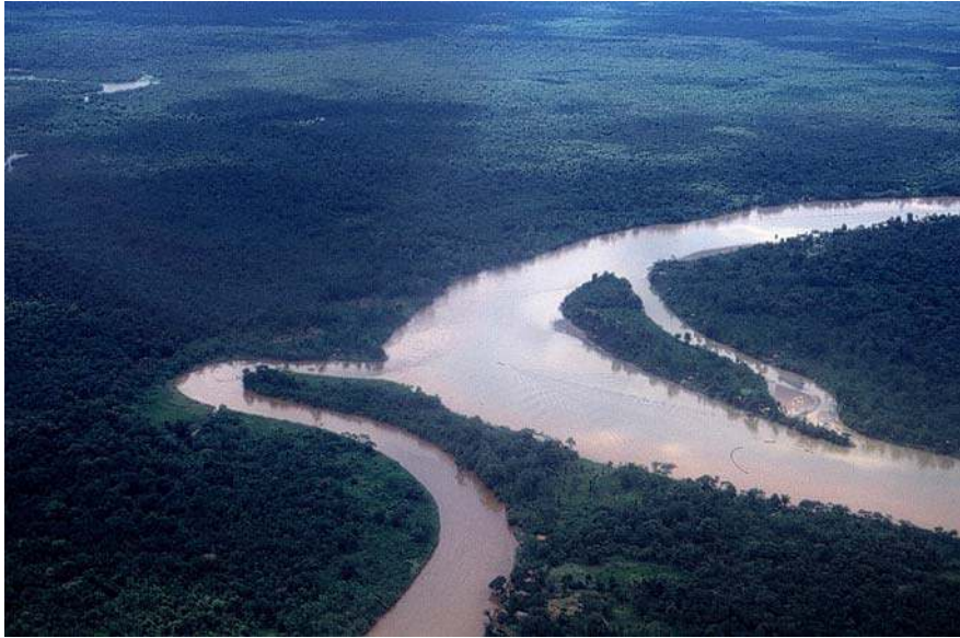
1. The lowland forest with Rio Atrato.