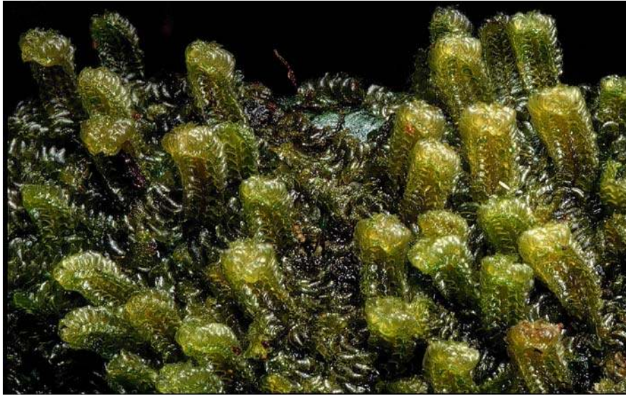
10. Cyclolejeunea peruviana growing in dense mats on a leaf.