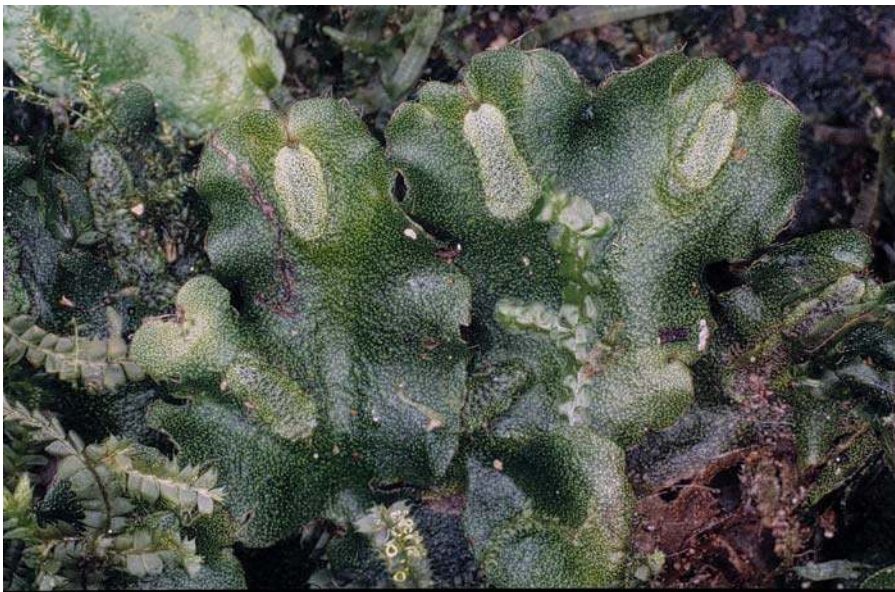
6. Male plants of the thallose liverwort Monoclea gottschei . With a length of up to 20 cm, this species is one of the largest liverworts in the world.