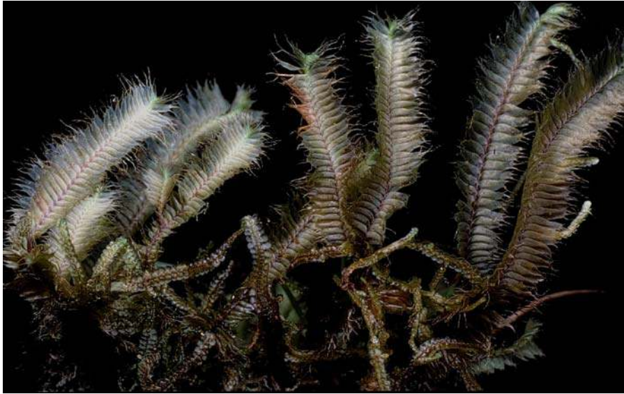
5. A species of Bazzania , a genus of liverworts characteristic for the montane rain forests.