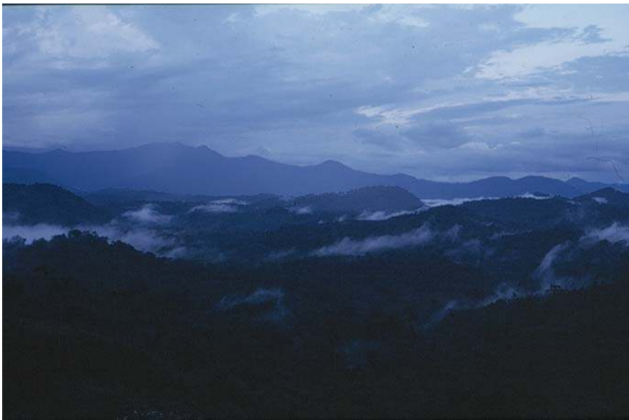
4. Steaming humidity is characteristic for the Chocó region.