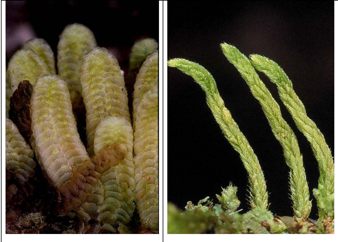
12. Left: Cyclolejeunea produces lentiform broodbodies, which have a sticky surface and are glued on the smooth surfaces of other leaves. Right: The moss Orthostichopsis tetragona characteristically grows on twigs in the canopy.