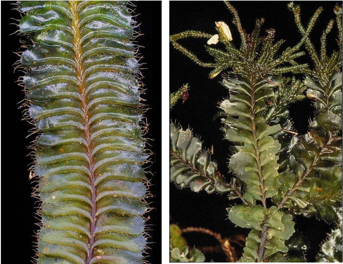
9. Plagiochila is one of the species richest liverwort genera in the Neotropics. Left: Plant of Plagiochila macrotricha . The leaf borders are longly ciliate and seem to function for condensation of water. Right: Male plants of Plagiochila spec. with microphyllous branches bearing the male sex organs (antheridia).