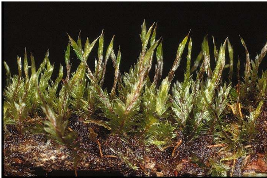
11. The moss Acroporium pungens usually grows on rotten wood. Due to the high humidity in the Chocó rainforests, it inhabits even small twigs.