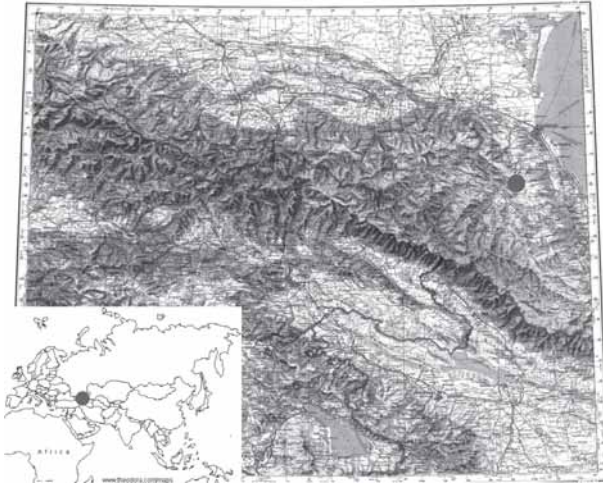
Fig. 1. Study area.