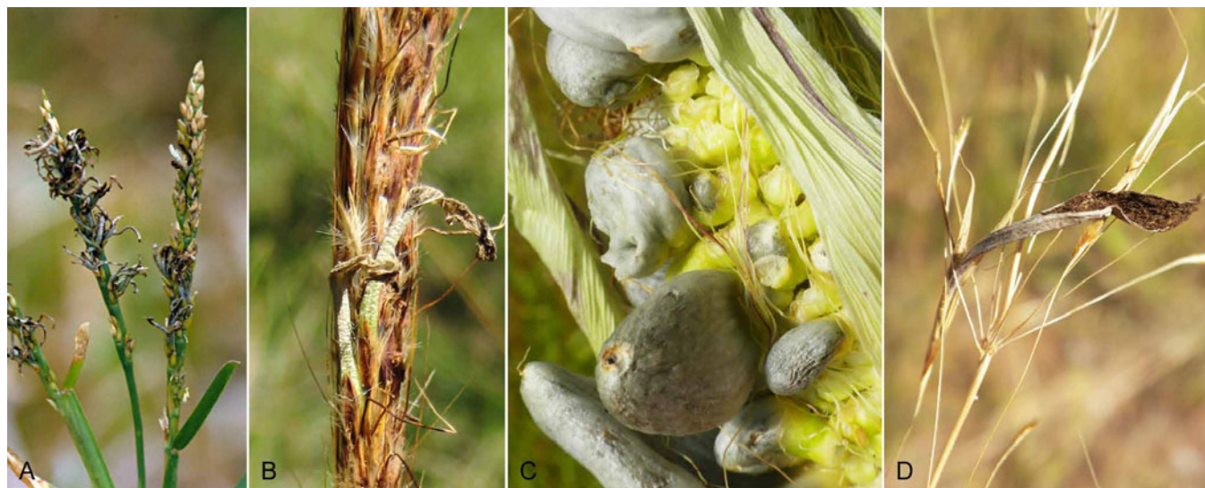
Fig. 2. A. Mycosarcoma bouriquetii on Stenotaphrum dimidatum (BRIP 26403). B. Mycosarcoma mackinlayi on Eulalia mackinlayi (BRIP 52549). C. Mycosarcoma maydis on Zea mays (BRIP 52746). D. Mycosarcoma tubiforme on Chrysopogon fallax (BRIP 57599).

Description: Sori usually in some ovaries of an inflorescence, derived from hypertrophied host material, often tubular, splitting longitudinally to expose the spore mass, partitioning