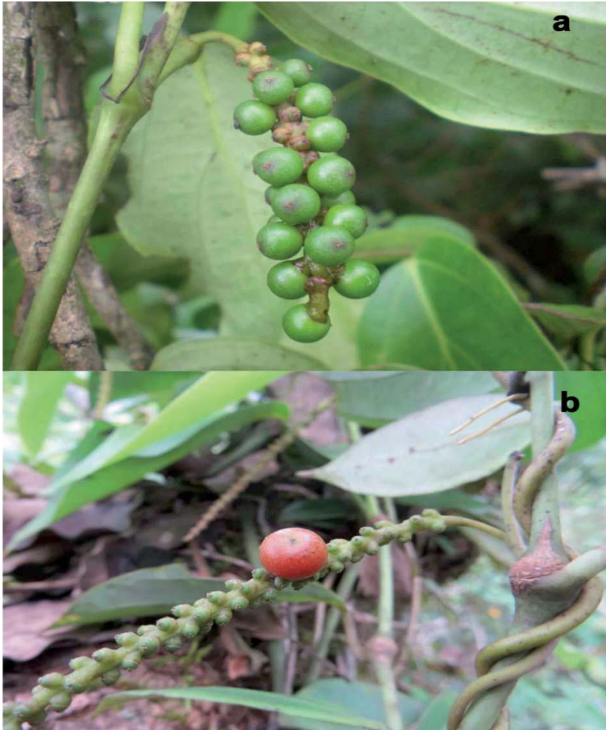
Fig. 2. Piper rukshagandhum a , infructescence; b , mature fruit. Photos: J. Mathew (Mathew 2811).