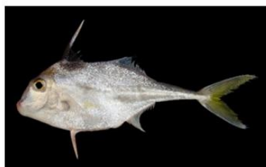
Paramonacanthus choirocephalus Pseudotriacanthus strigilifer