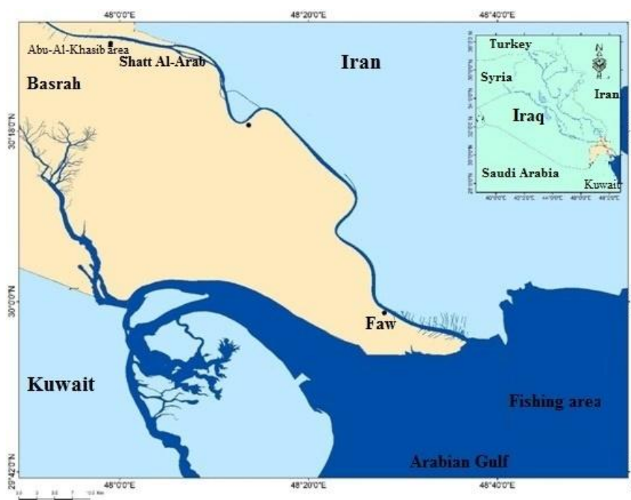
Map (1): Fishing area in the Iraqi marine waters.

Fish species were identified depending on Kuronuma and Abe (1986); Carpenter et al. (1997) and Froese and Pauly (2018). The fish images were taken by Canon SX600 HS. The arrangement of higher taxa (Classes, Orders and Families) of fishes followed Nelson (2006).