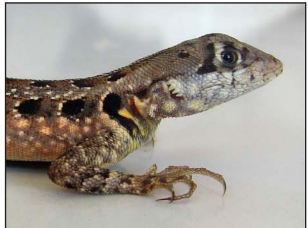
Figure 1. Tropidurus cocorobensis (LPE 1949), municipality of Floresta, state of Pernambuco, Brazil.

Comments. — Tropiduridae is a reptilian family with a large number of known species among the neotropical lizards (Torres-Carvajal, 2004). The genus Tropidurus occurs from southern Venezuela east through the Guianas to northeastern Brazil, from there west south of the Amazon region to eastern Bolivia, extreme northern Uruguay, and central Argentina (Frost et al. , 2001). In Brazil, there are 36 species of tropidurids, 18 of which belong to the genus Tropidurus (Bérnils and Costa, 2011). Currently, this genus is subdivided into four species groups: T. spinulosus , T. torquatus , T. bogerti , and T. semitaeniatus (Frost et al. , 2001). The Tropidurus torquatus group was revised by Rodrigues (1987), whose complex of species was well-defined through the geographical distribution and morphology based on the mite pockets and skin folds in the three major areas of the body (neck, axillary, and inguinal regions). Among the Tropidurus of the torquatus group, T. cocorobensis Rodrigues, 1987 (Fig. 1) is a psammophilous lizard, endemic from the Brazilian Caatinga. It was described from the municipality of