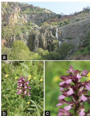
Fig. 2. Anacamptis papilionacea subsp. schirwanica ; (a) Habitat, Silé waterfall locality, south aspect of Dostaka mountain, Akré province (Duhok governorate) Pseudosteppe grassland habitats in middle open Gall oak forest. (b) Habit. (c) Inflorescence. 09 April, 2016..

In classical floras (for example, Flora of Turkey and Flora Iranica), this taxon was treated under the genus Orchis . Recently, this species has been proposed to be considered in the separated genus Anacamptis (Kretzschmar, et al., 2007; Véla and Viglione, 2015), but some others specialists propose to place it in another small genus Vermeulenia according to Löve and Löve (1972). Kretzschmar, et al. (2007) reported six subspecies mainly distributed in Mediterranean Region except one in Irano-Anatolian and eastern Caucasian Region. A. papilionacea subsp. schirwanica is given for Azerbaijan and