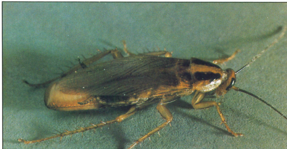
The German cockroach (above) is the most common and troublesome of those found in California, but the brownbanded cockroach (below) is reported to be increasing in some areas. Though roaches are easily killed by available insecticides in laboratory tests, field-trapped specimens often are resistant to chemical control.

rants, grocery stores, hospitals, jails, hotels, homes, apartments, and just about any place where food is regularly prepared or stored. They are often associated with unsanitary conditions and are potential mechanical transmitters of a variety of pathogenic bacteria and viruses. Some people develop contact or inhalant allergic reactions to the