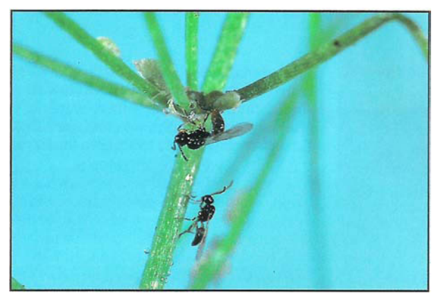
Above, Trioxys brevicornis on asparagus oviposits into EAA as second T. brevicornis searches for EAA. At right, EAA mummies have been parasitized by T. brevicornis .

velop at this time in response to environmental factors, such as crowding, and can fly to uninfested asparagus. In fall, sexual females and winged males are produced, mate, and lay eggs on the fern to begin the overwintering cycle. In warmer climates, EAA asexual generations continue uninterrupted.