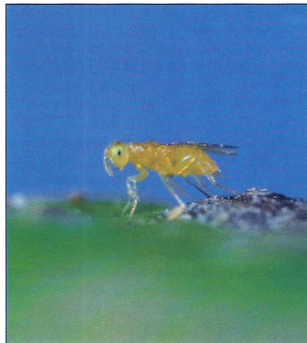
Aphytis melinus .

Field-collected parasites were considered resistant if they showed 5% survival