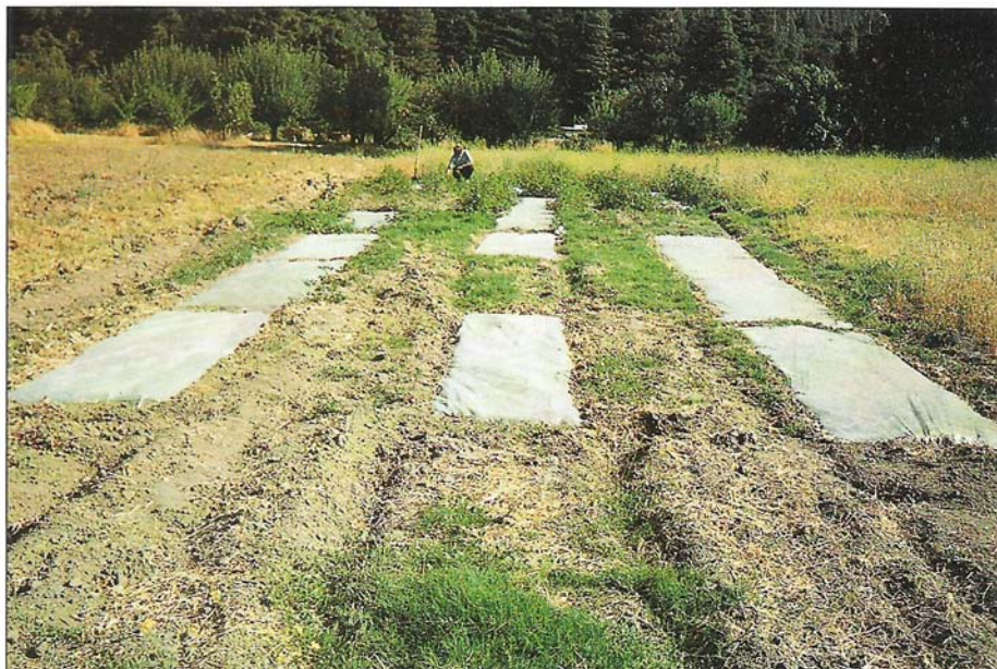
Site location for bermudagrass and redroot pigweed control in Humboldt County, 1989. The picture was taken 10 weeks after solarization began. The bare strips are where tarps were removed after 6 weeks; tarps still in place indicate the 14-week solarization.