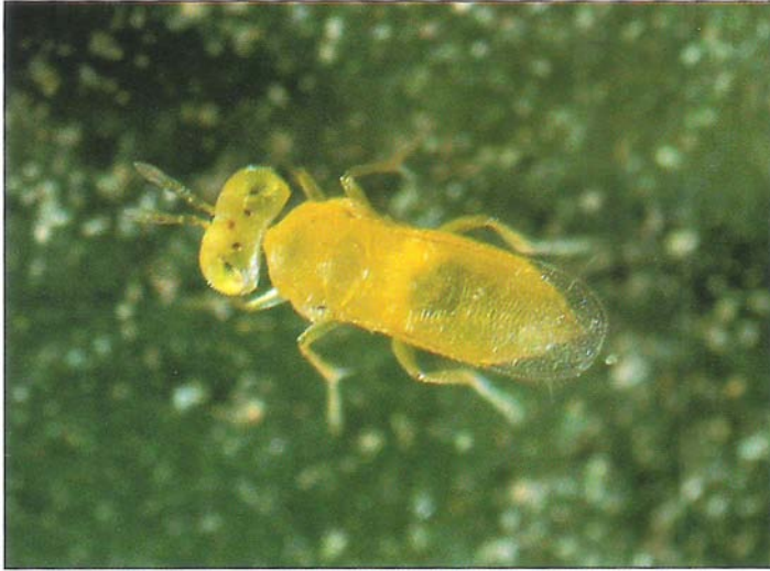
Resistance to Sevin may increase the effectiveness of the parasitic wasp, Aphytis melinus , in controlling California red scale in pesticide-treated orchards.