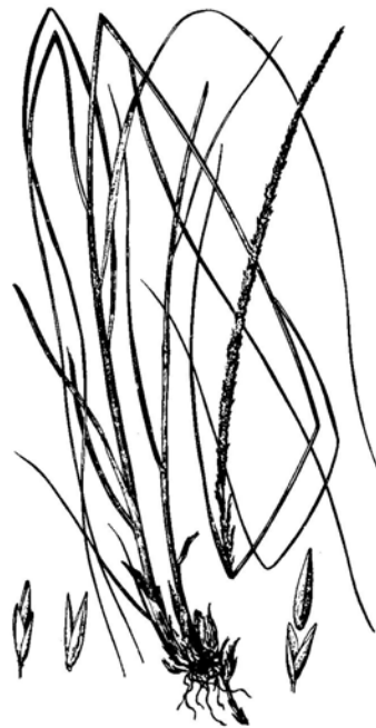
Deergrass Muhlenbergia rigens