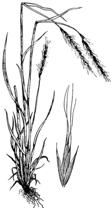
Blue Wild Rye Elymus glaucus