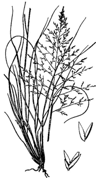
Alkali Sacaton Sporobolus airoides