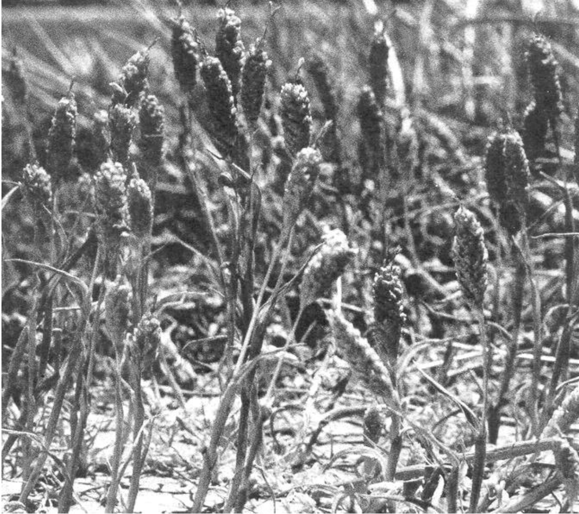
Neostapfia colusana , a rare annual grass found in vernal pools, was photographed near Denverton, in the Jepson Prairie-Vernal Pools area, by Fraser Muirhead.

paid a total of $750,000 ($900,000 was considered the fair market value). $375,000 was received from one donor. California Native Plant Society contributed $5000. The rest remains to be raised from corporate gifts and large and small donations from the public.