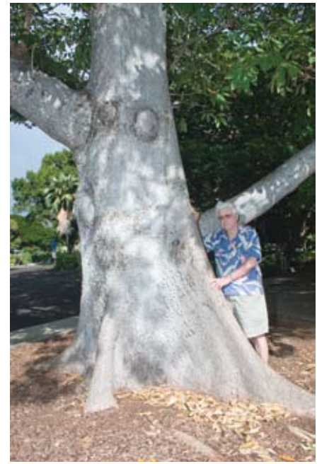
Figure 4. (Left) Branches of Bombax ceiba are typically arranged in distinct, uniform, and mostly symmetrical whorls or tiers (Los Angeles County Arboretum and Botanic Garden, Arcadia, California).