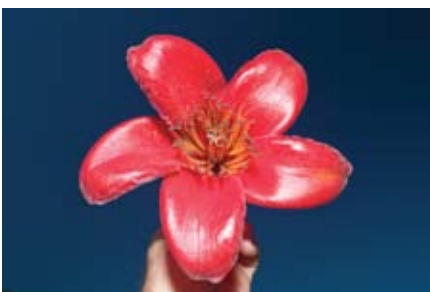
Figure 13. (Lower left) Flowers of Bombax ceiba are large, up to seven inches across (Los Angeles County Arboretum and Botanic Garden, Arcadia, California).

However, red silk-cotton trees do best and tend to become gregarious on deep sandy, well drained loams on alluvium near rivers and streams (Mub 2007). It sometimes occurs on heavier but well drained soils on slopes.