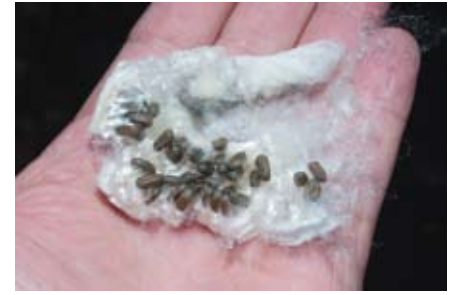
Figure 17. (Right) Seeds of Bombax ceiba are small, black or brown, and embedded in the cottony material (Foster Botanical Garden, Honolulu, Hawaii).

feet, and have trunks 15 to 18 inches in diameter.