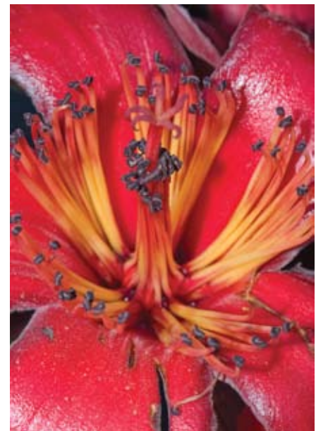
Figure 14. (Lower right) Stamens of Bombax ceiba are yellowish with reddish tinged tips and clustered in bundles (Los Angeles County Arboretum and Botanic Garden, Arcadia, California).

in 1968 is now about 60 feet tall and wide and has a trunk about five feet in diameter. Two trees received by the Los Angeles County Arboretum and Botanic Garden in Arcadia, California in 1979, which originated as scion material grafted on to Ceiba speciosa (formerly Chorisia speciosa ), are now 30 to 40 feet tall, spread for 25 to 35