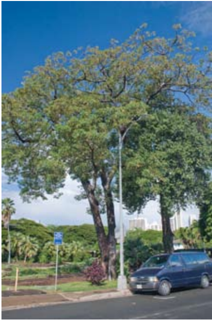
Figure 20. (Left) This Bombax ceiba at Queen Kapiolani Rose Garden in Kapiolani Park, Honolulu, Hawaii is about 40 feet tall and wide and has a short trunk about three feet in diameter that branches into a double leader about 10 feet above the ground.