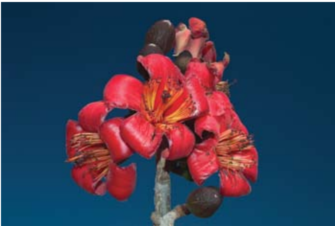
Figure 11. (Upper left) Flowers of Bombax ceiba are solitary but typically densely placed near branch tips (Los Angeles County Arboretum and Botanic Garden, Arcadia, California).