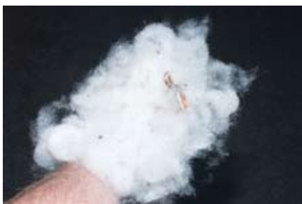
Figure 19. (Center) The white cottony material contained in the fruits of Bombax ceiba can litter the landscape for some distance (Foster Botanical Garden, Honolulu, Hawaii).