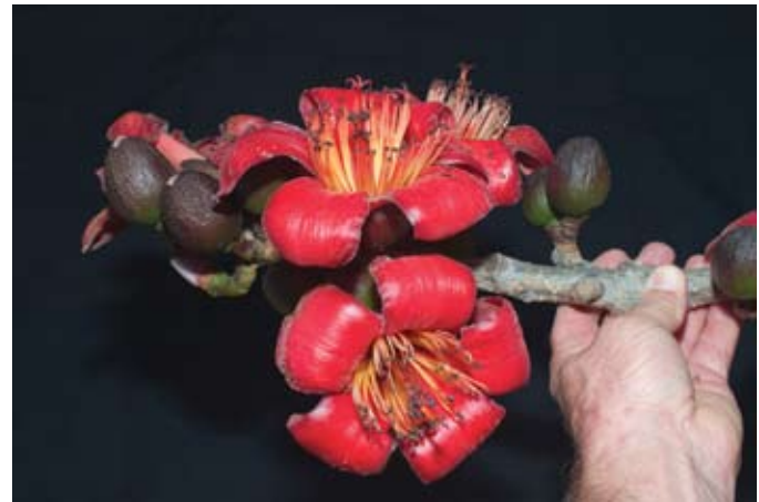
Figure 12. (Upper right) Flowers of Bombax ceiba are densely placed, large, and showy (Los Angeles County Arboretum and Botanic Garden, Arcadia, California).

a mostly distinct summer maximum rainfall pattern. Mean annual rainfall is variable throughout the region and ranges from 30 to 175 inches (Mub 2007). Growth and development are best in areas where rainfall is more evenly distributed throughout the year. Humidity is usually always high. Mean maximum temperatures for the warmest months range from about 85 to 95 F with maximums ranging from 100 to 122 F. Mean minimum temperatures in the coolest months range from 50 to 75 F with minimums ranging from 36 to 63 F (Mub 2007). Frosts are rare but occur at the higher altitudes and latitudes of its distribution.