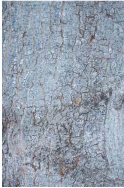
Figure 8. (Upper center) Bark of Bombax ceiba becomes rough and checked on older trees (Foster Botanical Garden, Honolulu, Hawaii).

Trunk: impressive, straight, often stout, 1-5 feet in diameter (Fig. 6), often short and thick on cultivated specimens in open sites but a straight, symmetrical bole 50-125 feet to the first branch on forest specimens growing under favorable conditions; invariably buttressed at the base on large specimens (Fig. 6), the buttresses extending up the trunk for 15-25 feet.