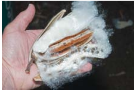
Figure 16. (Center) Fruits of Bombax ceiba split open along five seams to reveal white, cottony, silky material (Foster Botanical Garden, Honolulu, Hawaii).