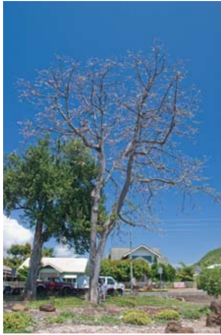
Figure 21. (Center) Co-author Paul Weissich provides scale for the same tree in Figure 16 that is now devoid of leaves in late March and bears numerous fruits.

Garden in Kaneohe and accessioned in 1986 are about 50 feet tall, spread for 45 feet, and have trunks nearly two feet in diameter. Staples and Herbst (2005) report that a red silk-cotton tree is at The Queens Medical Center in Honolulu but we have not seen it.