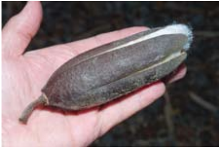
Figure 15. (Left) Fruits of Bombax ceiba are a pointed, longitudinally ribbed capsule (Foster Botanical Garden, Honolulu, Hawaii).