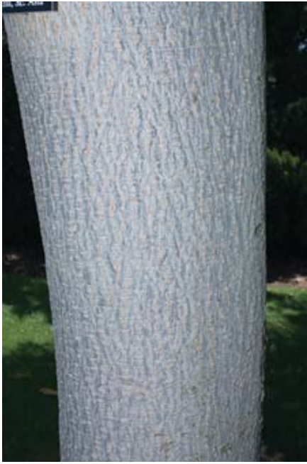
Figure 7. (Upper left) Bark of Bombax ceiba is smooth and greenish gray on young trees (Los Angeles County Arboretum and Botanic Garden, Arcadia, California).