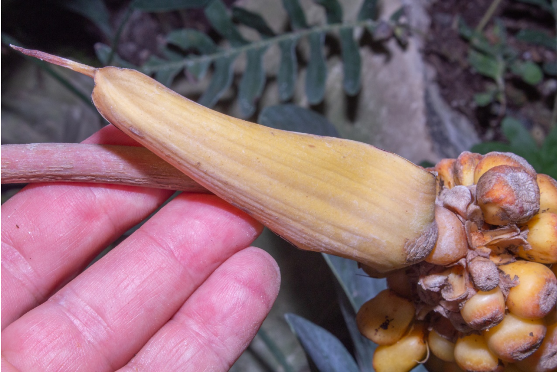
13. Anthurium roseonervium Croat & Hodel showing reflexed spathe of infructescence. Type plant, Hodel & Hodel 4004 .