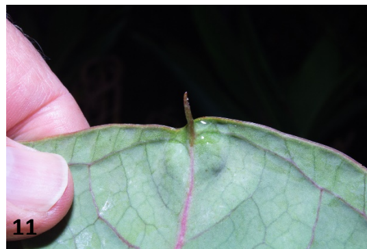
10–11. Anthurium roseonervium Croat & Hodel showing emarginate apex with a minute apiculum. Type plant, Hodel & Hodel 4004 .

ovate-sagittate ( Fig. 9 ), ca. 1.2 times longer than wide, 1.2 times longer than petioles, narrowly rounded and emarginate at apex with a short medial down-turned spine ( Figs. 10–11 ), prominently lobed at base, moderately coriaceous, dark bluish green, matte, slightly glaucous adaxially, moderately paler, bluish green, somewhat glaucous abaxially; major veins prominently raised, narrowly rounded on both surfaces, pale green adaxially (midrib weakly tinged reddish toward base), pinkish red abaxially ( Fig. 12 ); anterior lobe 33.3–34.5 cm long, convex along margins; posterior lobes 14–21 cm long, 11.5–16 cm wide, held erect or even