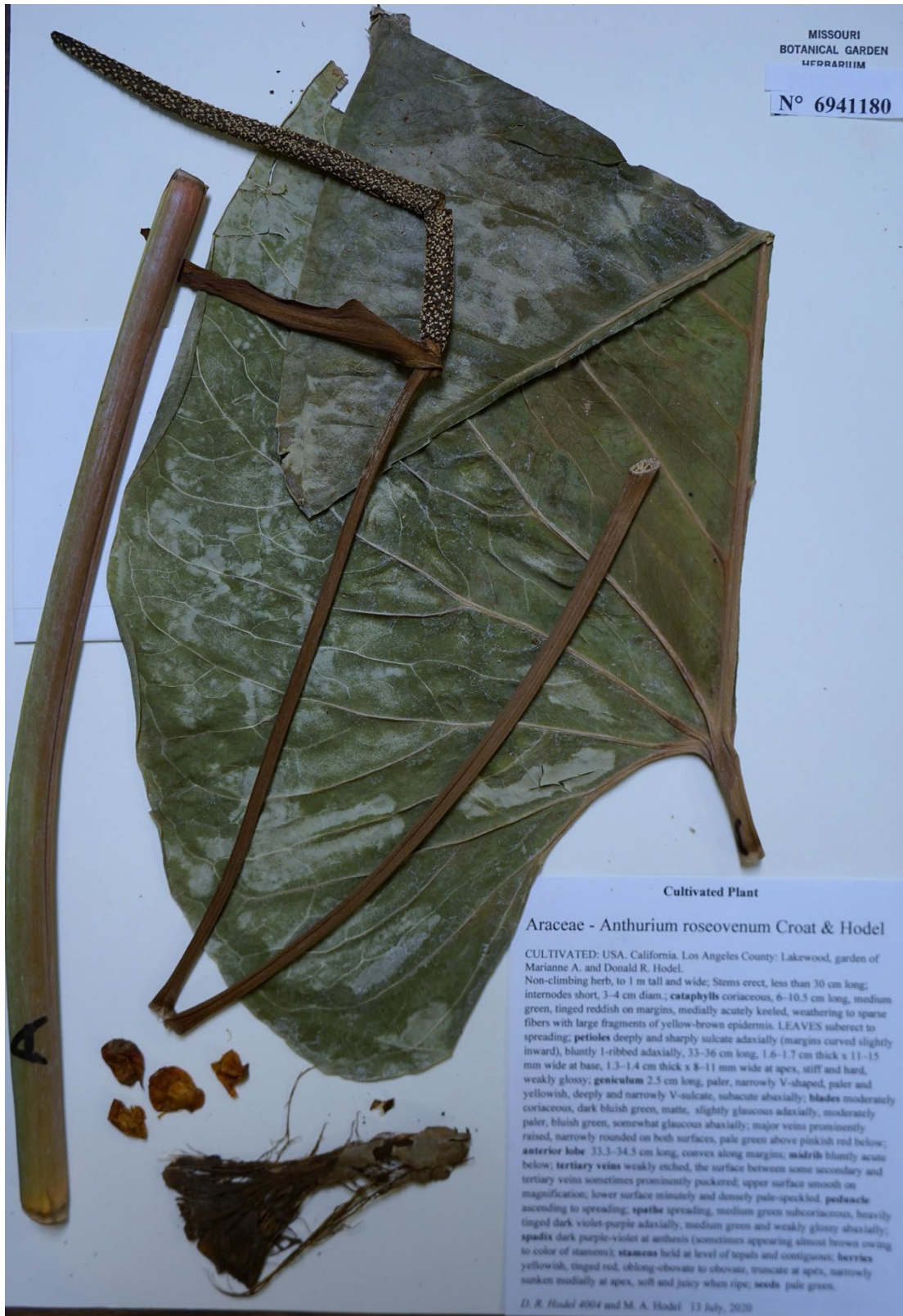
3. Holotype of Anthurium roseonervium Croat & Hodel, Hodel & Hodel 4004 (MO-6941180).