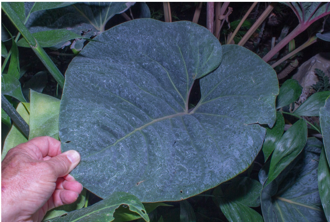
9. The blade of Anthurium roseonervium Croat & Hodel is ovate-sagittate, dark bluish green, and slight glaucous. Type plant, Hodel & Hodel 4004 .