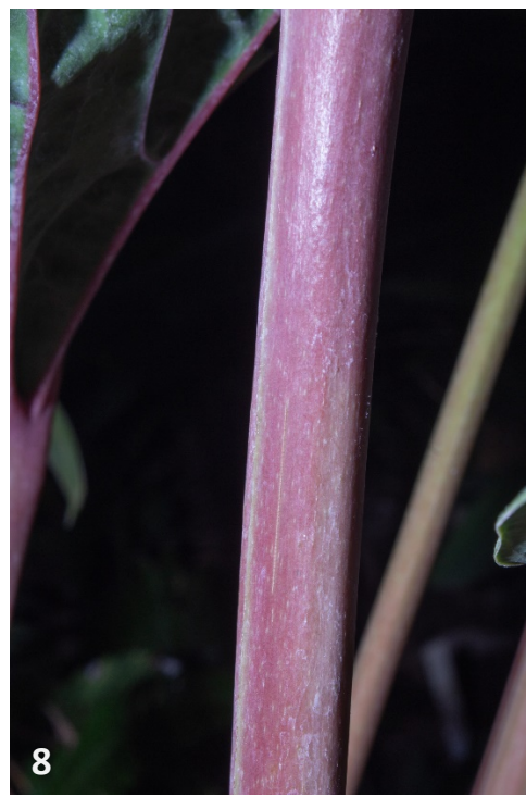
7–8. Petiole of Anthurium roseonervium Croat & Hodel. 7. Deeply and sharply sulcate adaxially. 8. Smooth and pinkish abaxially. Both from the type plant, Hodel & Hodel 4004 .