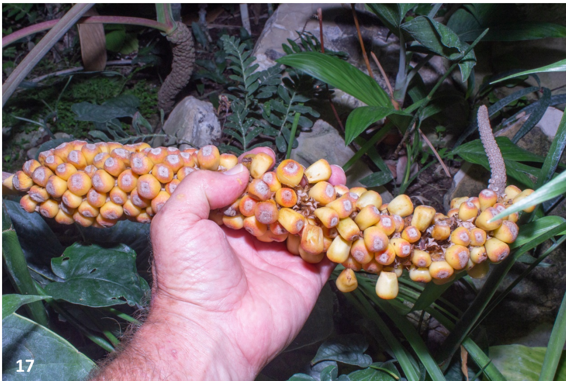
16–17. Infructescences of Anthurium roseonervium Croat & Hodel heavily laden with packed, contiguous fruits. Type plant, Hodel & Hodel 4004 .