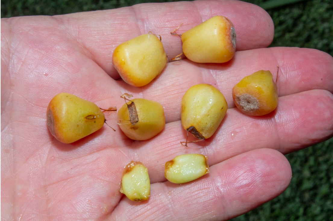
18. Fruits of Anthurium roseonervium Croat & Hodel heavily laden with packed, contiguous fruits. Note the two large, greenish seeds. Type plant, Hodel & Hodel 4004 .