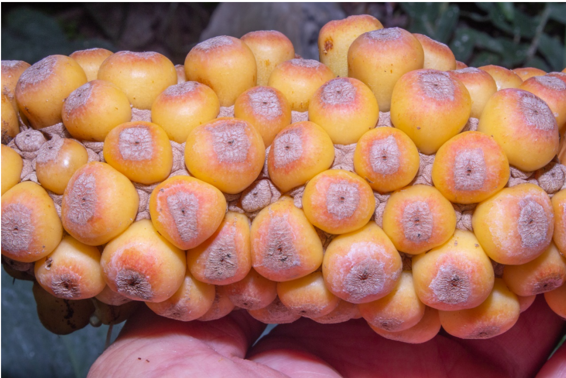
19. The densely packed fruits of Anthurium roseonervium Croat & Hodel are truncate and narrowly sunken apically. Type plant, Hodel & Hodel 4004 .