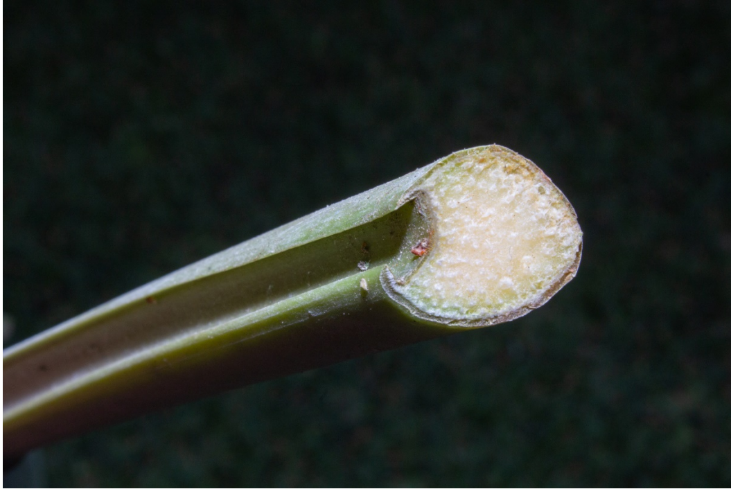
6. Petiole of Anthurium roseonervium Croat & Hodel is V-shaped in x-section. type plant, Hodel & Hodel 4004 .