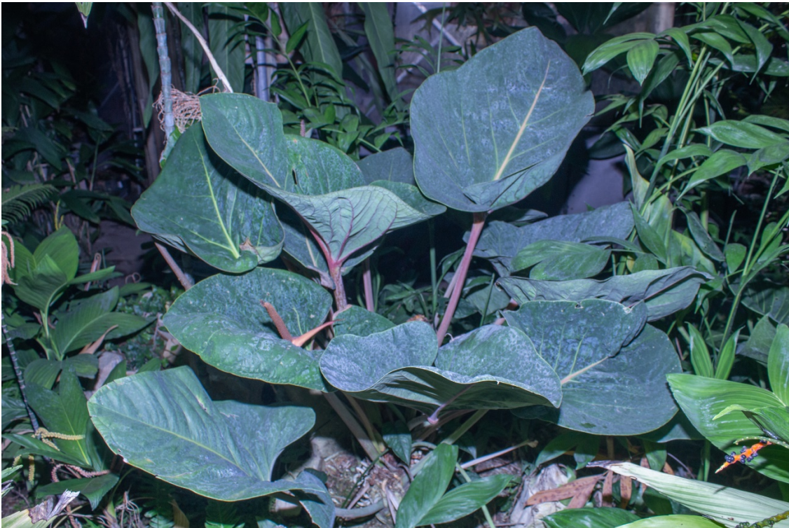
2. Anthurium roseonervium Croat & Hodel, habit, cultivated in Lakewood, California. Type plant, Hodel & Hodel 4004 .

This new species differs from all others in the genus by a combination of characters, including its non-climbing, likely terrestrial or lithophytic habit; short, thick internodes; semi-persistent cataphylls; nearly V-shaped, deeply sulcate petioles with the margins acute and in turned; moderately coriaceous and weakly glaucescent, ovate-sagittate blades with the apex rounded and weakly emarginate and with a short apiculum and a short medial down-turned spine, and deeply lobed at base with a parabolic to weakly hippocrepiform sinus; up to seven pairs of basal veins with two free to the base, a bluntly acute midrib, four to five pairs of primary lateral veins, collective veins arising from the first or second pair of primary lateral