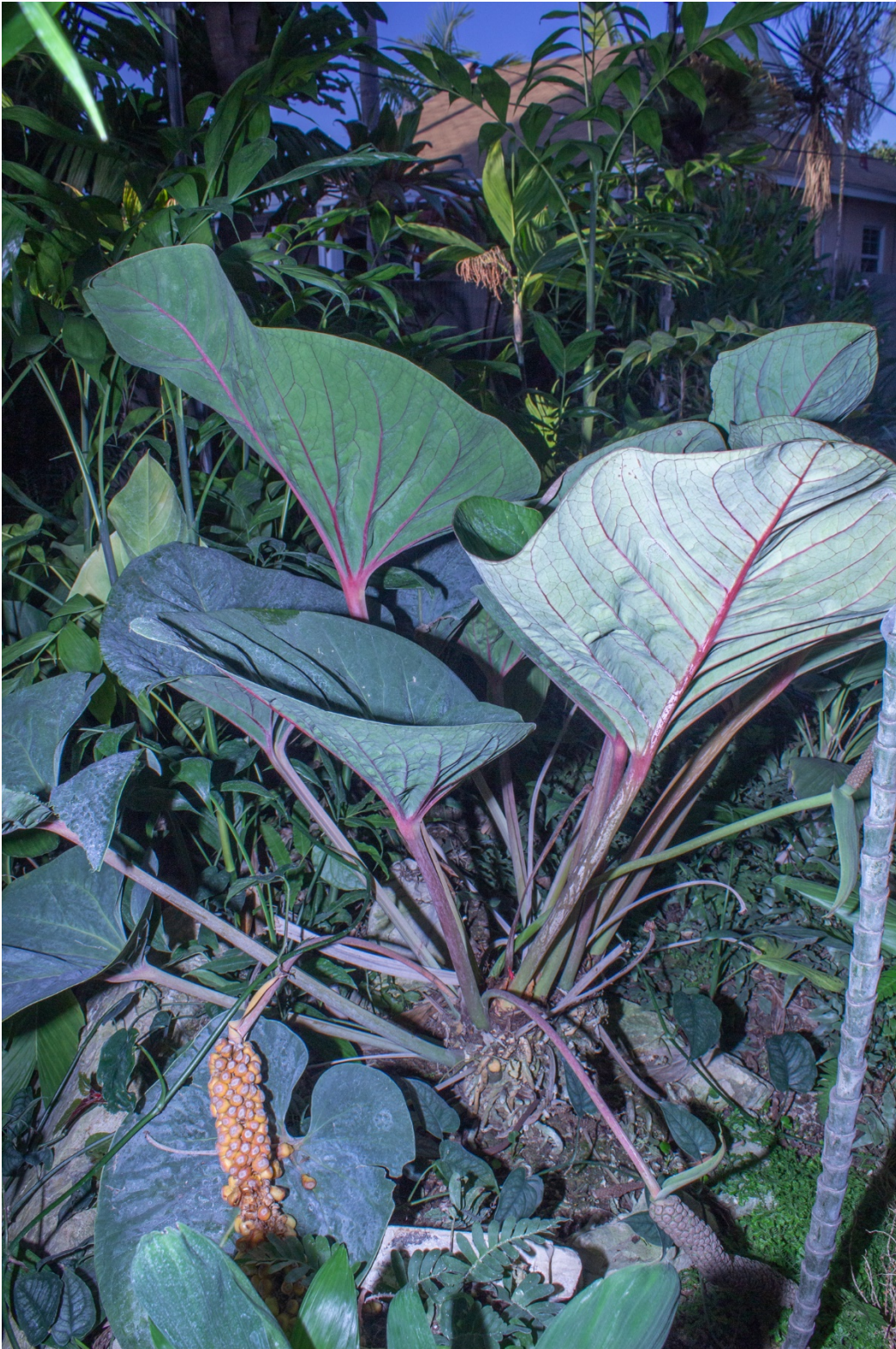
1. Anthurium roseonervium Croat & Hodel, habit, cultivated in Lakewood, California. Type plant, Hodel & Hodel 4004 . Note the reddish pink nerves.