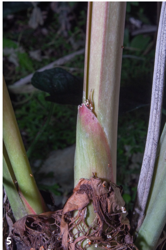
4–5. Anthurium roseonervium Croat & Hodel. 4. Stem, showing short internodes. 5. Cataphylls. Both from the type plant, Hodel & Hodel 4004 .