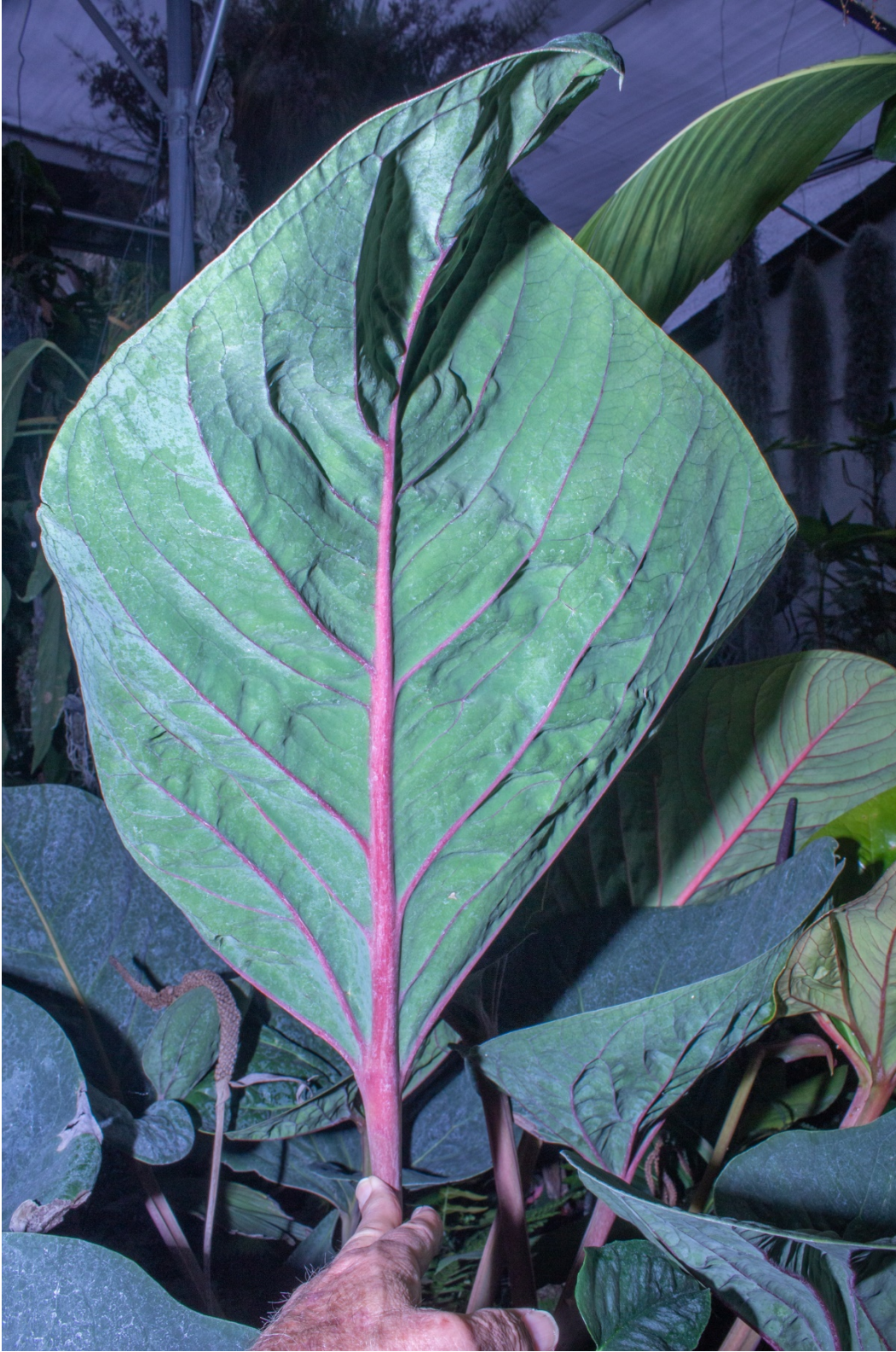
12. Anthurium roseonervium Croat & Hodel showing reddish pink nerves on the abaxial leaf blade surface. Type plant, Hodel & Hodel 4004 .