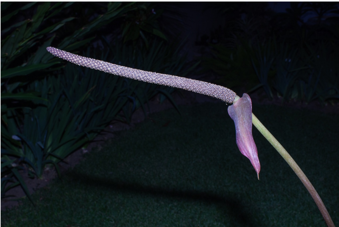
14. Spadix of Anthurium roseonervium Croat & Hodel showing reflexed spathe at staminate anthesis. Type plant, Hodel & Hodel 4004 .