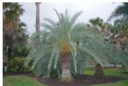
Figure 144. (Right) The acanthophylls of Phoenix theophrasti are yellowish and among the fiercest in the genus (43719, The Huntington Library, Art Collections, and Botanical Gardens, San Marino, CA).