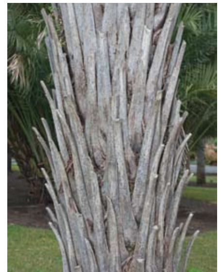
Figure 141. (Above) Phoenix pusilla can be distinguished from P. reclinata by the narrow, persistent, stick-like leaf bases arranged in a vertical manner on the trunk giving it a slat-like appearance (29445, The Huntington Library, Art Collections, and Botanical Gardens, San Marino, CA).