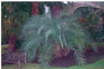
Figure 140. (Left) Phoenix pusilla is much like P. reclinata in habit (29445, The Huntington Library, Art Collections, and Botanical Gardens, San Marino, CA).

the narrow, persistent, stick-like leaf bases arranged in a vertical manner on the trunk giving it a slat-like appearance (Fig. 141). There are a few specimens in botanical gardens in southern California.