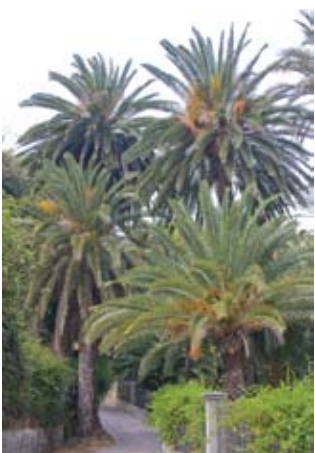
Figure 147. (Right) Another Phoenix canariensis × P. reclinata makes a large clump with graceful leaves (Villa Ormond, San Remo, Italy).

Figure 146. (Center) This Phoenix canariensis × P. reclinata is a large, handsome plant (Reptile Walk, San Diego Zoo, San Diego, CA).