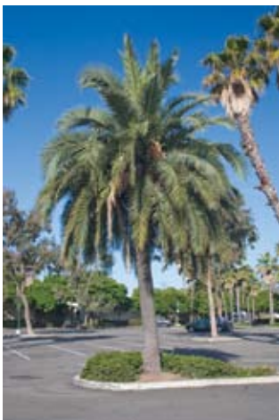
Figure 154. (Right) Another possible Phoenix canariensis × P. rupicola is at the Chavez Ravine Arboretum, Elysian Park, Los Angeles, CA.