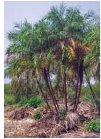
Figure 137. (Left) Phoenix sylvestris is widely cultivated on the Indian subcontinent and adjacent areas, as here at Ton-gup, Rakhine, Myanmar (Burma).