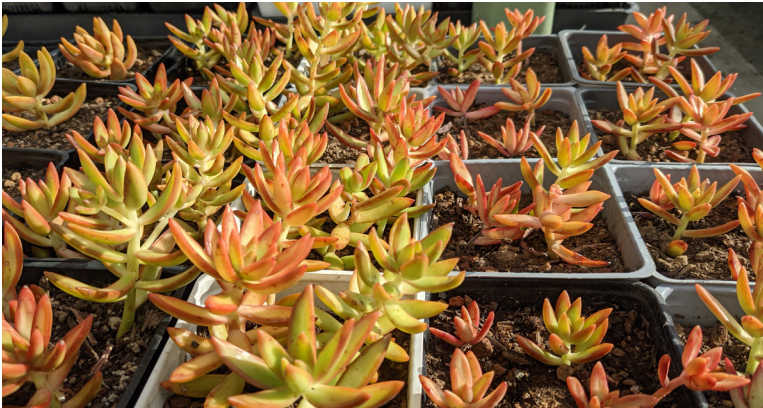
Sedum adolphi 'Firestorm'