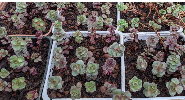
Sedum spurium 'Dragon's Blood'