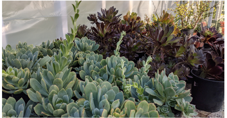
Aeonium decorum var guarimarense

Cotyledon orbiculata Cotyledon orbiculata var oblonga Cotyledon pendens