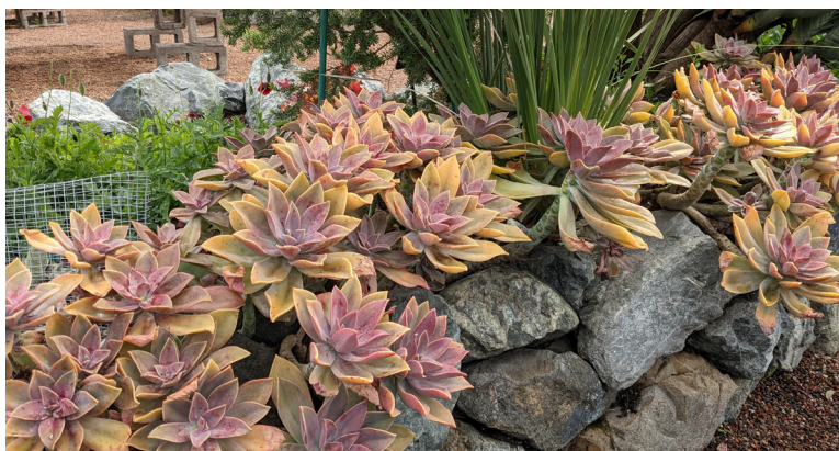
Graptoveria 'Fred Ives'