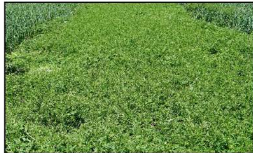
Lana Woolypod Vetch