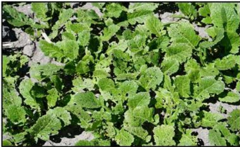
Flea Beetle Damage