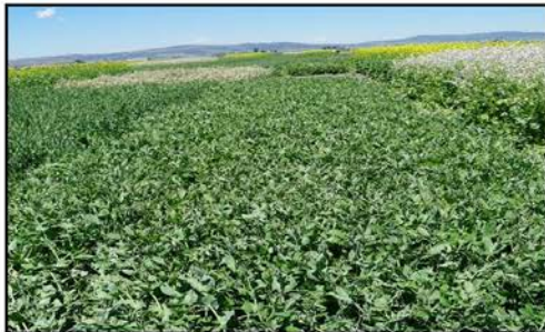
Flex Field Pea