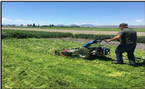
Chopping a plot