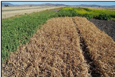
SX17 sorghum sudangrass