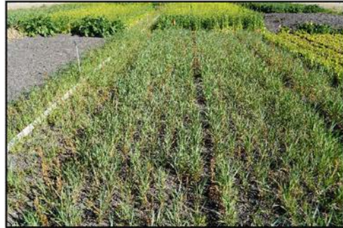
Trical 141 spring triticale