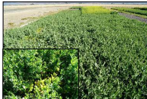
Radish and spring pea mix