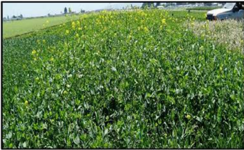
Caliente Mustard & Flex Pea Mix