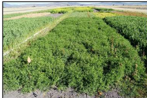
Lana woolypod vetch