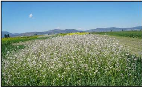
Defender Oilseed Radish