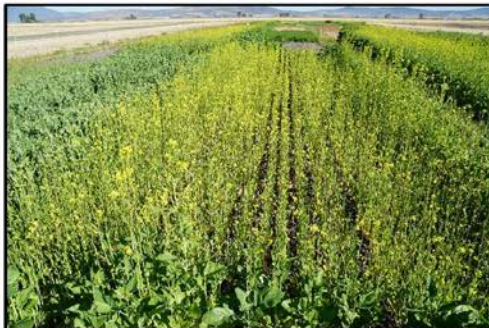
Caliente 199 mustard