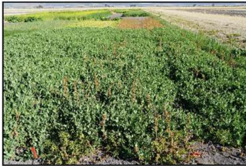
Nutrigreen winter field pea