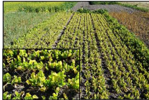
Defender oilseed radish