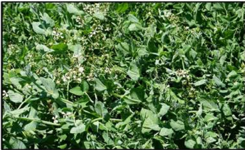
Nemat Arugula & Flex Pea Mix