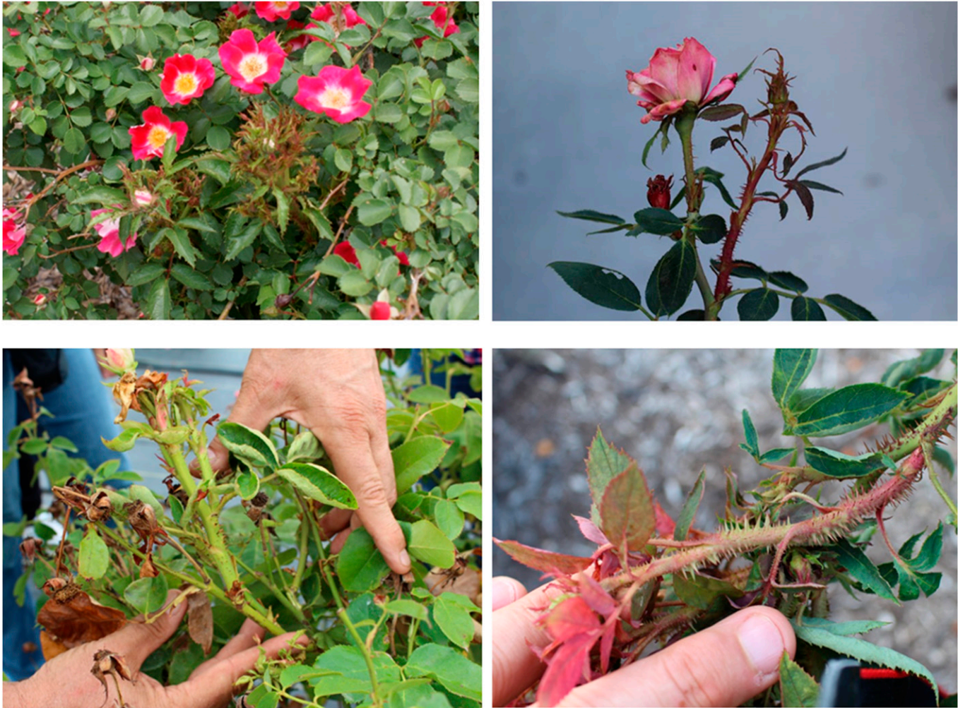
Fig. 2. Typical symptoms of rose rosette disease including the formation of a rosette, strapping of leaves, and the increased thickness and thorniness of the stems.