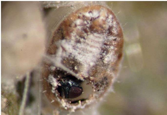
Figure 7. Aleuroctonus sp. emerging from a rugose spiraling whitefly pupa.

Under laboratory conditions, adult Aleuroctonus sp. are observed walking among or over whitefly nymphs. Once a suitable host is found, the wasp assesses the host using its antennae, which is seen as a vibration of the antenna. Soon after, the wasp rubs its front legs very quickly against the body of the host. This behavior often lasts a few minutes with one to few inactive periods in between. Most of these interactions, however, lead to the rejection of the host by the wasp. This is in contrast with the behavior of E. guadeloupae , which quickly starts probing into the host with its ovipositor. Only a few cases of Aleuroctonus host assessments lead to probing behavior (Fig. 8).