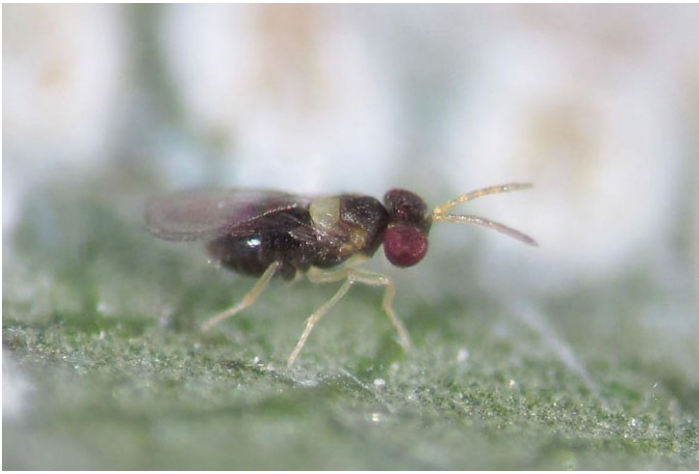
Figure 2. Lateral view of Encarsia guadeloupa .