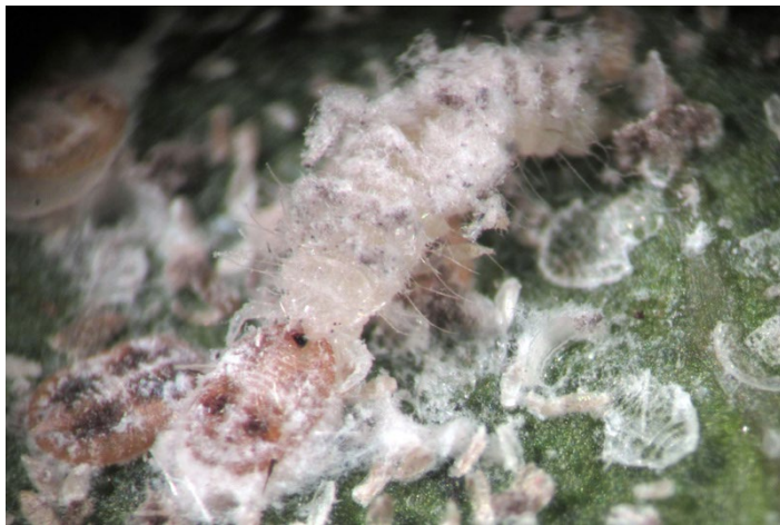
Figure 10. Nephaspis oculata larva attached to a fourth instar RSW nymph.