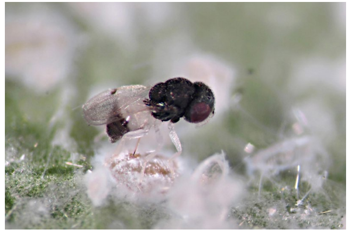
Figure 8. Aleuroctonus sp. probing into a rugose spiraling whitefly nymph.

Under laboratory conditions, adult Aleuroctonus sp. are observed walking among or over whitefly nymphs. Once a suitable host is found, the wasp assesses the host using its antennae, which is seen as a vibration of the antenna. Soon after, the wasp rubs its front legs very quickly against the body of the host. This behavior often lasts a few minutes with one to few inactive periods in between. Most of these interactions, however, lead to the rejection of the host by the wasp. This is in contrast with the behavior of E. guadeloupae , which quickly starts probing into the host with its ovipositor. Only a few cases of Aleuroctonus host assessments lead to probing behavior (Fig. 8).