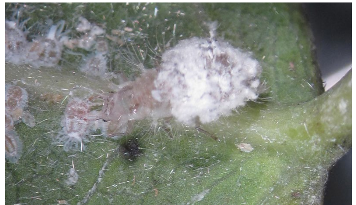
Figure 17. Lacewing larva feeding on the whitefly nymphs.

Lacewing larvae collected from whitefly-infested trees in south Florida were reared to adults in the laboratory and determined to be Ceraeochrysa sp. These lacewings have been observed consuming rugose spiraling whitefly nymphs (Fig. 17). Adults (Fig. 18) are distinguished by their wing venation and the reddish pigments on the scape of the antennae.