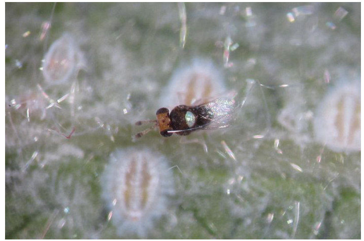
Figure 4. Female Encarsia noyesi walking among whitefly nymphs.