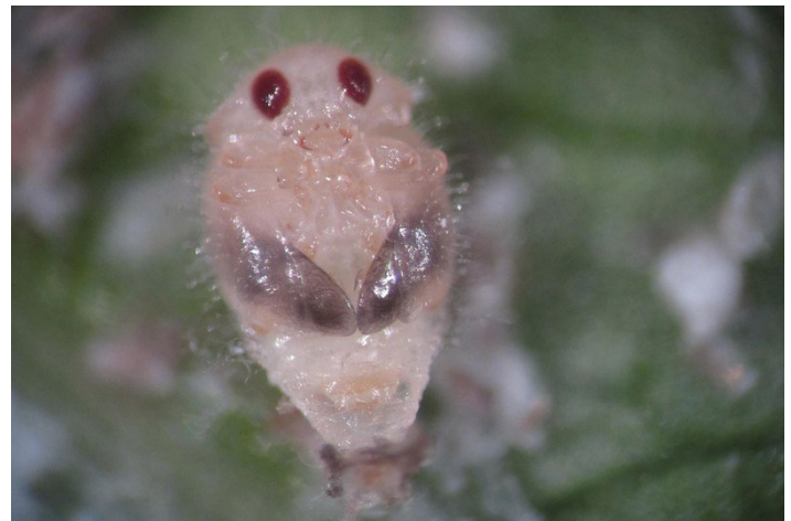
Figure 13. Ventral view of Nephaspis oculata pupa.