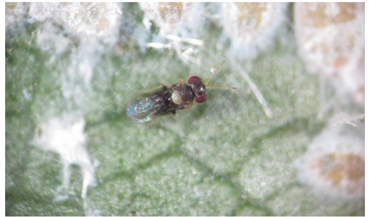
Figure 1. Dorsal view of Encarsia guadeloupae