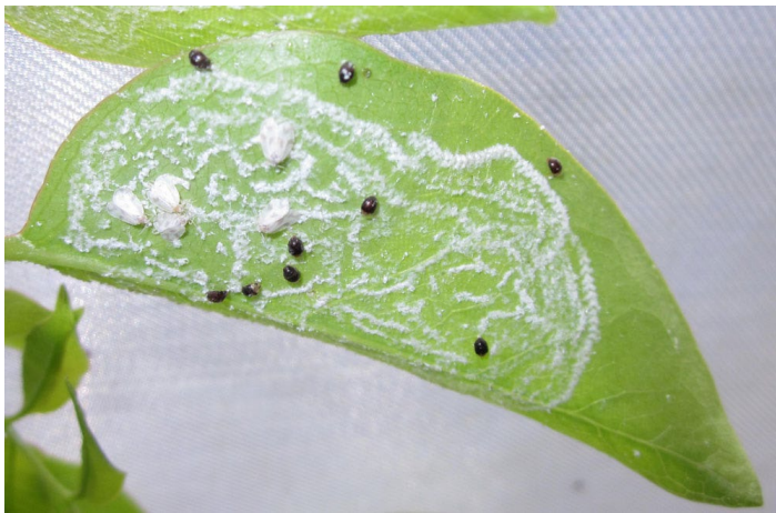
Figure 15. Adult Nephaspis oculata feeding on whitefly eggs.