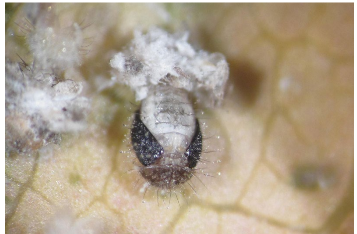
Figure 12. Nephaspis oculata pupa in its natural position close to adult emergence (dorsal view).