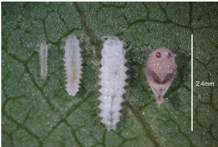
Figure 9. Nephaspis oculata . 2 nd , 3 rd , 4 th instars and pupa (waxy flocculent material from rugose spiraling whitefly removed).