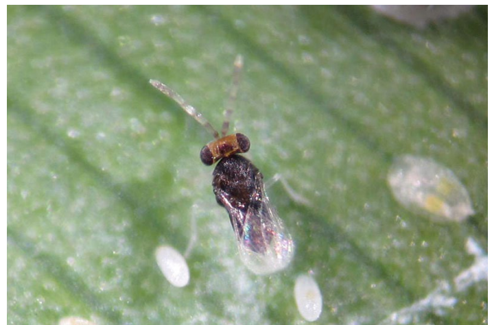
Figure 5. Male Encarsia noyesi .