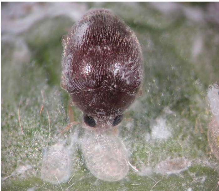
Figure 16. Female Nephaspis oculata feeding on a 4 th instar whitefly. The body contents of the nymph are almost completely withdrawn by the beetle.

Adult beetles have been observed feeding on eggs and all instars of rugose spiraling whitefly. In an outdoor caged colony, we observed adult beetles aggregating on leaves with freshly laid egg spirals whenever the whitefly nymphs become scarce (Fig. 15).