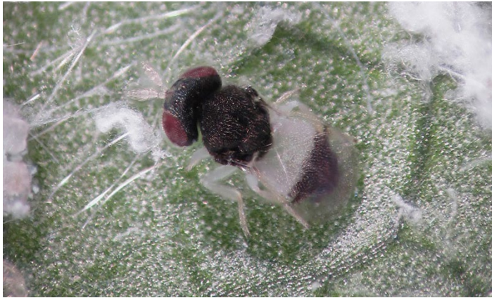
Figure 6. Aleuroctonus sp.

standing still, its body is held at a slant with the head held much higher than the tip of the abdomen. Size, color, and stance make them easy to differentiate from E. guadeloupae and E. noyesi . Exit holes in whitefly nymphs from Aleuroctonus are usually larger than exit holes from the Encarsia species (Fig. 7).