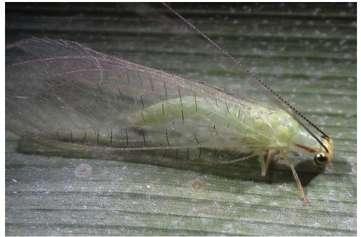
Figure 18. Adult Ceraeochrysa sp.