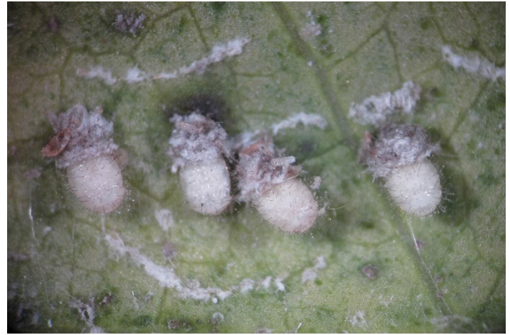
Figure 11. Nephaspis oculata pupae on gumbo limbo.

Beetle pupae can be found easily on the lower surface of the leaves. They are whitish at first (Fig. 11) but become darker closer to adult emergence (Fig. 12). The approximate age of the pupae can be determined by the general color of the body and the pigmentation of eyes and elytra (Fig.13).