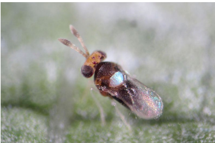
Figure 3. Female Encarsia noyesi .

This wasp was originally imported from Mexico to California to control giant whitefly, Aleurodicus dugesii (Barton 1997). In 1998, it was imported from California to Florida to control the same whitefly species (Nguyen and Hamon). In 2012, this wasp was first collected from rugose spiraling whitefly infestations in Key Biscayne, FL, and continues to be collected from that site. Females of E. noyesi can be distinguished from E. guadeloupa by their light colored head (dark in E. guadeloupa ) and iridescent bluish-white scutellum (yellow in E. guadeloupa ) (Fig. 3 and 4). Adult males (Fig. 5) have a light colored head but have a dark scutellum.