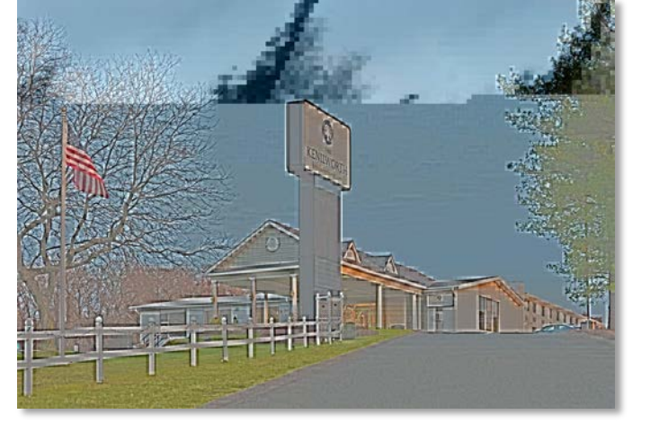
The Kenilworth Hotel.