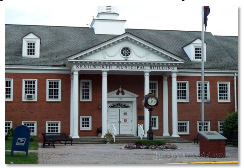
Kenilworth Municipal Building.

Kenilworth is traversed by the Garden State Parkway and is close to Route 22 which runs through Union to the north. Although it does not have a train station stop, Kenilworth is close to the Raritan Valley Line with stops in nearby Roselle Park, Cranford and Union. Kenilworth is served by NJ Transit bus lines 58, 65, 114 and 117. Over