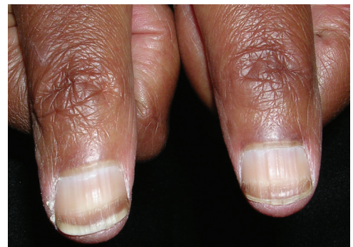
Figure 9. Beau lines. These grooves run horizontally on the nail plate and are caused by an interruption of nail bed mitosis.

Beau lines ( Figure 9 ) are horizontal grooves on the nail plate and generally involve most or all of the nails. They reflect an interruption of nail bed mitosis caused by severe illness, pemphigus, high fever, or chemotherapy. 1 Beau lines also occur in patients with Raynaud disease. Treatment is aimed at the underlying etiology.