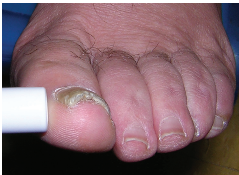
Figure 13. Pincer nail. This condition is characterized by the transverse overcurvature of the nail plate.