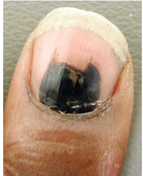
Figure 8. Subungual hematoma. This condition is caused by bleeding in the underlying vascular nail bed as a result of trauma.