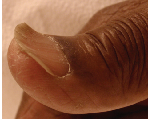
Figure 11. Koilonychia (spoon nail). This condition is characterized by concavity of the nail and is often associated with iron deficiency anemia.