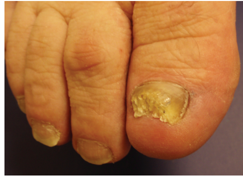
Figure 5. Onychomycosis. The condition is caused by a fungal, yeast, or nondermatophytic mold infection of the nail and occurs in more than 10 percent of the population. 2

Onychomycosis encompasses fungal, yeast, and nondermatophytic mold infections of the nail, and predominantly occurs in the distal and lateral portion of the toenails (Figure 5). Onychomycosis can be classified based on the location of the nail bed involved. Distal subungual onychomycosis is the most common form, with dermatophyte spread in the palmar or plantar skin. In patients with proximal subungual onychomycosis, fungal elements appear in the deeper layers of the nail plate; this is more common in immunocompromised patients. White superficial onychomycosis is found in the toenails where fungi colonize the surface of the nail plate. Candidal onychomycosis is rare and may be a sign of underlying immunosuppression. 16