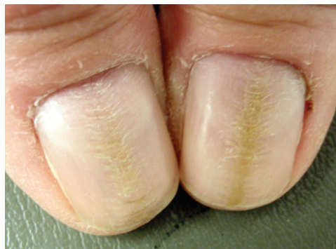
Figure 2. Dystrophic nails. This condition is induced by repeated manipulation of the nail plate, such as with manicures, biting, or rubbing.

Longitudinal melanonychia (Figure 4), also known as vertical nail bands, are hyperpigmented bands that occur as normal variants