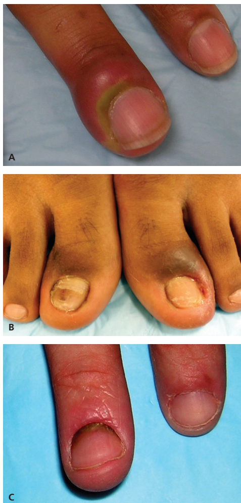
Figure 6. Paronychia. This condition is an inflammatory reaction caused by bacterial invasion of the folds of tissue surrounding the nail. (A) Acute paronychia is characterized by the rapid onset of erythema, edema, and tenderness at the proximal nail folds. (B) Chronic cases are similar in appearance to acute cases, but last more than six weeks and the cuticle may separate from the nail plate. (C) Paronychia associated with pseudomonal infection is typically caused by repeated minor trauma in a wet environment and often causes a green discoloration.

Paronychia associated with a pseudomonal infection shares many of the same characteristics of acute and chronic paronychia; however, pseudomonal paronychia commonly leads to a green discoloration (Figure 6C). Pseudomonal superinfection is typically caused by repeated minor trauma to the nail apparatus in a chronically wet environment. 6,7 Persons at risk of this condition include bartenders, dishwashers, and habitual nail-biters.