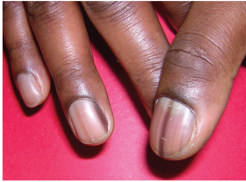
Figure 4. Longitudinal melanonychia (vertical nail bands). These hyperpigmented bands occur as normal variants in 90 percent of black persons. 18