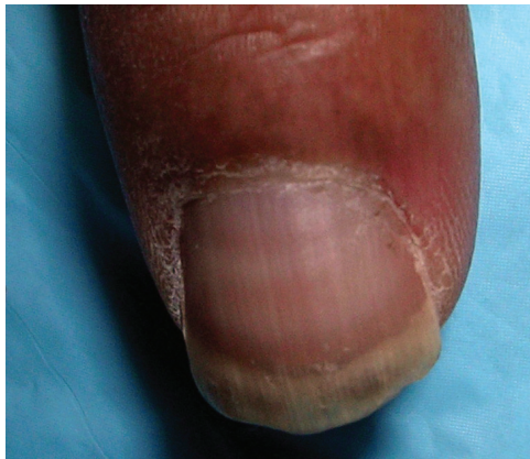
Figure 12. Muehrcke lines. Localized pathology within the nail bed leads to pairs of transverse white lines.