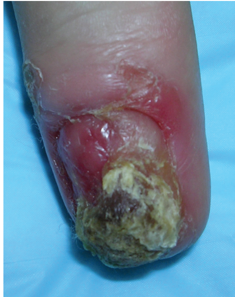
Figure 7. Squamous cell carcinoma of a fingernail. Because it is often mistaken for other conditions, a biopsy is required for diagnosis.