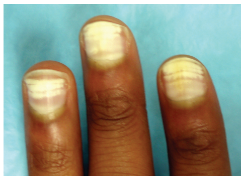
Figure 3. Leukonychia. This condition is characterized by a white discoloration of the nail plate from abnormal keratinization of the underlying nail matrix.