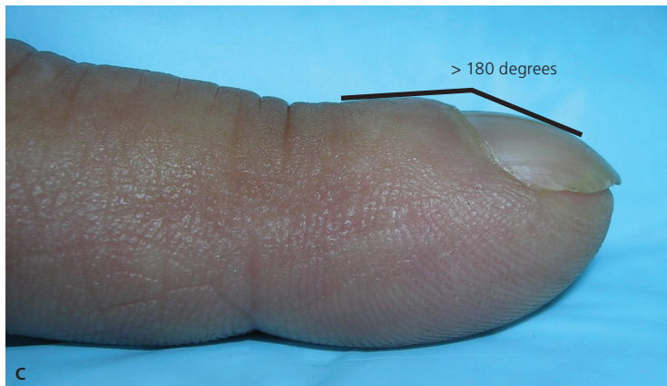
Figure 10. Clubbing of the nail. This condition usually affects all of the fingernails and involves (A) thickening of the nail bed's soft tissue, particularly the proximal end. Diagnostic findings include (B) Schamroth sign (absence of the diamond-shaped opening that is normally present when the digits are opposed) and (C) Lovibond angle (the angle between the nail plate and the soft tissue of the distal digit is greater than 180 degrees).