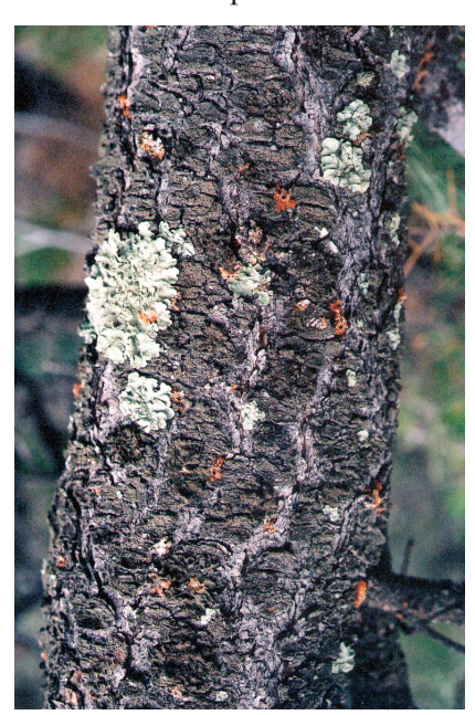
Ips confusus pitch tubes on infested pinyon pine trunk.

No chemical treatment exists for trees or wood already infested by ips beetles. In rare cases where it is feasible to reduce the threat to live trees by killing beetles within infested trees before they exit, treatments involve bark removal, chipping the wood into small pieces, covering piles with a double-layer of 6-mil thick clear plastic sealed around the edges with soil to heat (solarize) the wood, or physical removal of infested material from the site to an area a mile or more from susceptible trees.