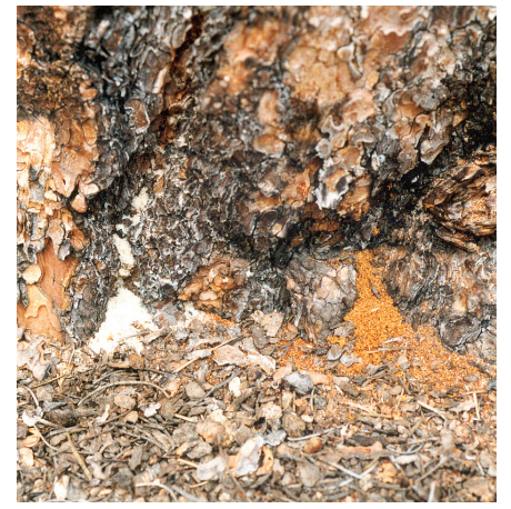
Boring dust at the base of a pine tree. Reddish boring dust is caused by ips beetles. The whitish dust is from ambrosia bark beetles.