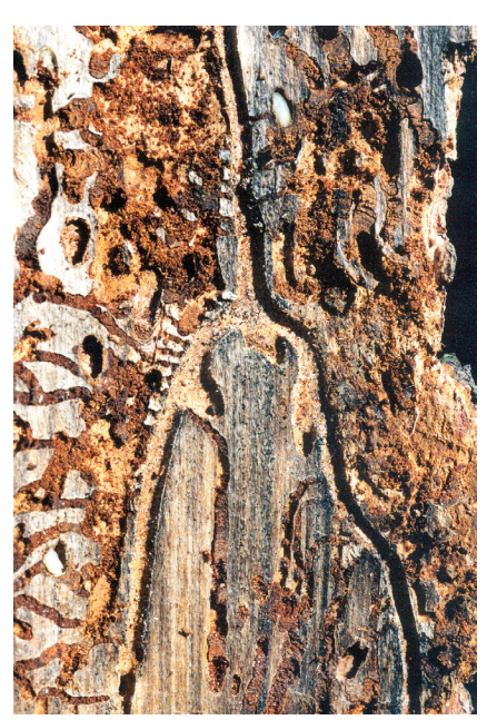
Ips pini egg galleries under bark of ponderosa pine trunk.

Colorado State University, U.S. Department of Agriculture, and Colorado counties cooperating. CSU Extension programs are available to all without discrimination. No endorsement of products mentioned is intended nor is criticism implied of products not mentioned.