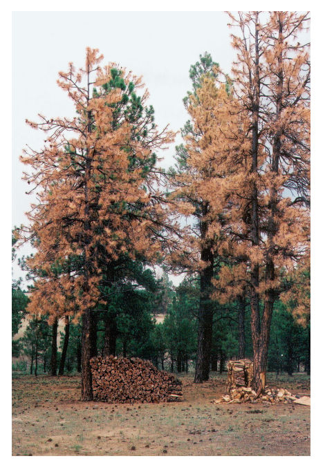
Storing cut firewood near susceptible trees greatly increases the risk of ips beetle attack.