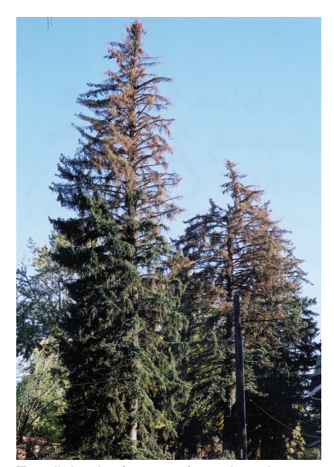
Top dieback of spruce from drought stress and ips attack.