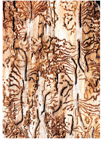
Tunneling by Ips hunteri in blue spruce.

Note: Concentrations of insecticides used to control bark beetles are often considerably greater than those used for insects on foliage. To avoid needle burning, try to limit the application to the bark, particularly when using liquid (emulsifiable concentrate) formulations that have increased risk of causing plant injuries.