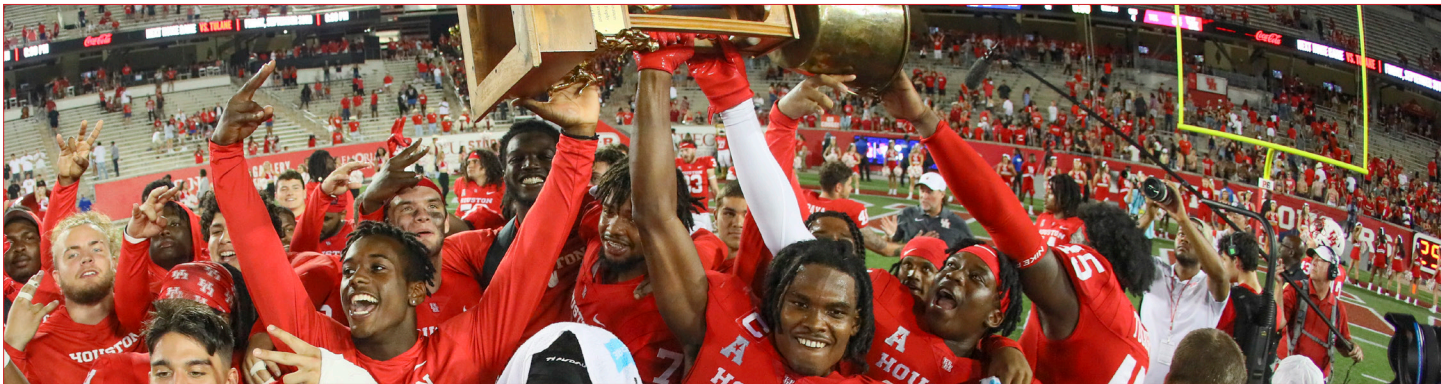
Houston used a late rally to secure its seventh consecutive victory over Rice, defeating the Owls, 34-27, a season ago inside TDECU Stadium.