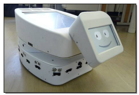
Fig. 1. The IROMEC robot in the horizontal configuration (early prototype version).

The IROMEC robot [36] has two different configuration possibilities: horizontal and vertical. In the horizontal configuration (see fig. 1) the interaction module is attached to the mobile platform in order to support a complete set of activities requiring a wider mobility and dynamism of the robot. In the vertical configuration the interaction module is connected to a dedicated docking station to provide both stability and recharging. Additionally, the robot has several interfaces such as dynamic screens for input and output, buttons and wireless switches. In order to satisfy the needs of children with autism, the robot is also equipped with a simple mask to cover the small face screen.