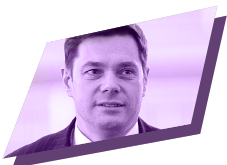
Alexey Mordashov, head of the Board of Directors of «Severstal» Steel and Mining Company