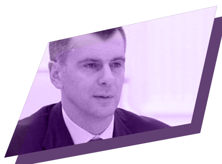
Mikhail Prokhorov, President of «ONEXIM» Investment Group