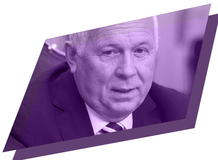
Sergei Chemezov, Director General of «Rostekh», a state company in the field of high- tech industry