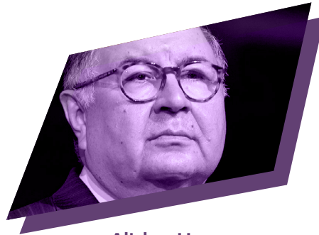
Alisher Usmanov, founder of «USM Holdings» Metallurgy and Mining Holding