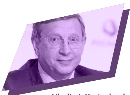
Vladimir Yevtushenkov, head of the Board of Directors of «Sistema» Investment Company

In 2015, the Fund's executive director boasted that the share of public funding in the organisation's budget was declining 17 . However, non-state funding sources are unknown since the Fund does not publish information about donors. Most likely, those are the oligarchs and heads of big state enterprises represented in the Fund's Board of Trustees. Those include: