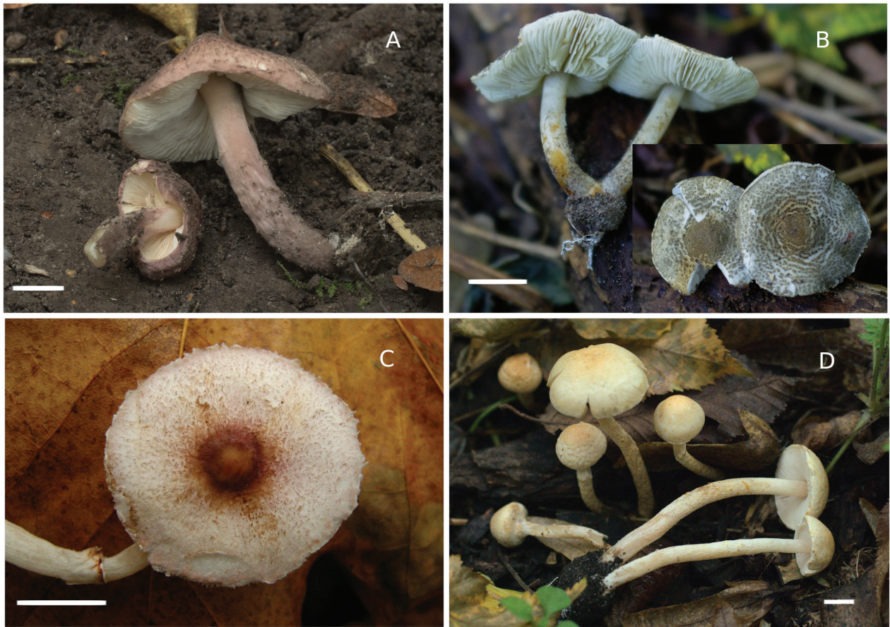
Fig 1. Fruit bodies of Lepiota species. A: L. fuscovinacea ; B: L. griseovirens ; C: L. roseolivida ; D: L. subalba . Bars: 1 cm