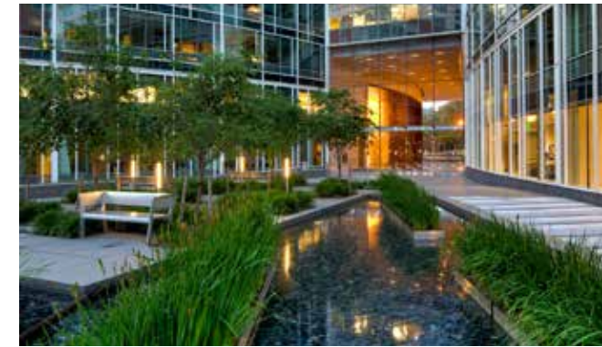
The attractive courtyard water feature holds captured runoff from the roof after it has been cleansed by the treatment system.