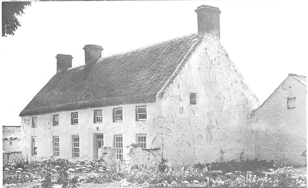
59. BANOGE BRIDGE