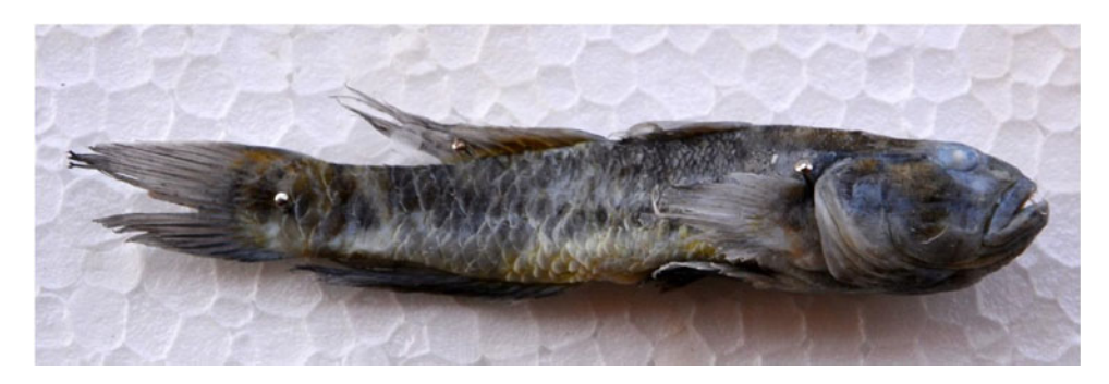
Fig. 2. Acentrogobius dayi, USMN 435345, 108 mm total length.