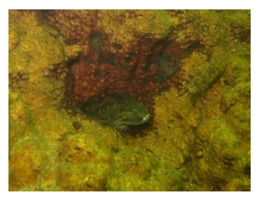
Fig. 3. Acentrogobius dayi inside small crevice at the bottom of the lake, watching Palaemon shrimp at the entrance of the hole, ready for a sudden attack.

Although Acentrogobius dayi has not previously been recorded from Sawa Lake, this may simply be due to the lack of appropriate ichthyological investigation methodologies. Previous investigations were mainly concerned with the lake's geology (Jamil, 1977; Naqash et al. , 1977; Awadh & Muslim, 2014). The current ichthyological investigation was the first time that scuba diving and specimen collection was included. The use of appropriate fish sampling methodologies such as scuba diving and underwater photography has already repudiated the presumed rarity of several species in other