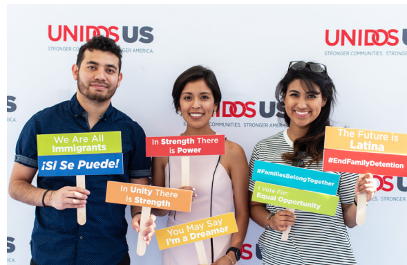
Attendees at the 2018 UnidosUS Annual Conference in Washington, DC taking photos with signs that highlight the issues and phrases that matter most to them.