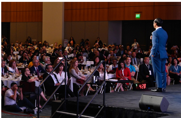
2020 Democratic Presidential Candidate Julián Castro speaking in front of a packed crowd at the 2019 UnidosUS Annual Conference in San Diego, CA.

Source: UnidosUS polling with Latino Decisions, June 1-14, 2019, “The 2020 Latino Electorate Survey,” http://publications.unidosus.org/bitstream/handle/123456789/1958/UnidosUS_surveycrossstab_June2019.pdf?sequence=2&isAllowed=y (accessed August 25, 2020).