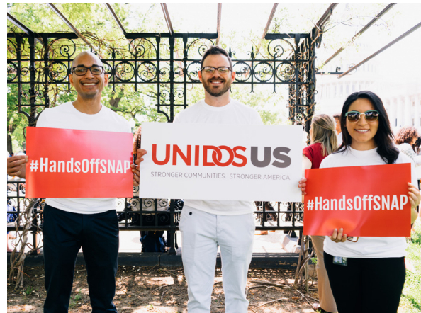
Images from rallies and press conferences centered around key issue areas, the economy, health, and immigration.

The decline in Latino support for Republicans, while not exclusively tied to immigration, matches up with a period of growing anti-immigrant and anti-Latino rhetoric and policies, conditions that propelled the issue of immigration reform to number two on the list of Latino voter priorities in 2010 and 2012, and the top spot in 2014 and 2016. While the sample sizes in these polls are different, they provide a quick comparative glance: between 2016 and 2020, the percentage of Latino voters who think that the Republican Party is doing a good job of reaching out to them has decreased slightly from 29% to 22%. And while the number of those who feel that it does not care much about Latinos has gone down from 36% to 31%, those who feel that the party is hostile to Latinos has grown from 30% to 47%, according to the latest tracking poll of Latino voters by the National Association of Latino Elected and Appointed Officials (NALEO). 26