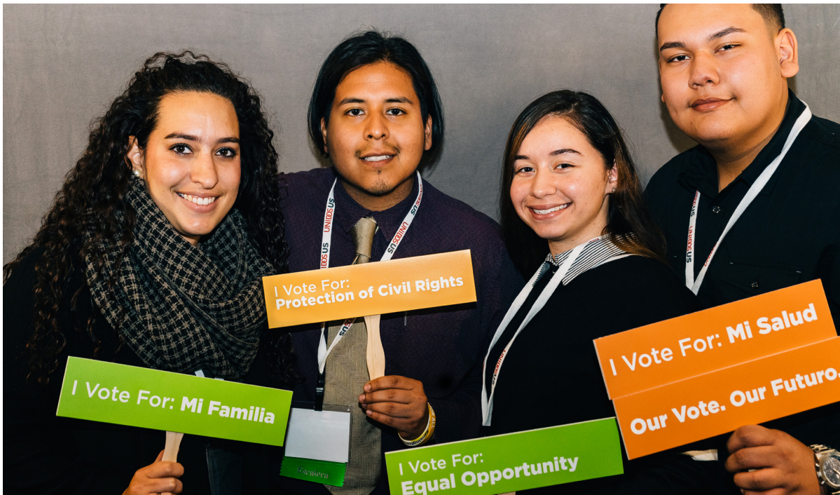
Attendees showing what they vote for at the 2018 UnidosUS Leaders in Action Summit in Washington, DC.

The traits that Latino voters want to see in their next president match their expressed priorities and concerns. Asked to choose the most important trait they would like to see in a presidential candidate, 25% of Latino registered voters said someone who “values diversity and brings people together.” This particularly matches up with increasing Latino voter concerns over discrimination. Another 18% said someone who “has realistic policy ideas,” and an equal percentage said someone who “fights for their priorities and is willing to compromise to get things done.” Moreover, although 33% said that speaking Spanish was important, only 2% chose that as the most important trait. Overall, Latino voters across gender and age had similar views on how they evaluated each of the various traits, as well as on those selected as the most important. There was greater difference in the order of priority traits when looked at by party identification. While the same three were the most cited, for Latino Republicans the order was (1) willing to compromise to get things done, (2) having achievable policy ideas and goals, and (3) valuing diversity and bringing people together (see Figure 4).