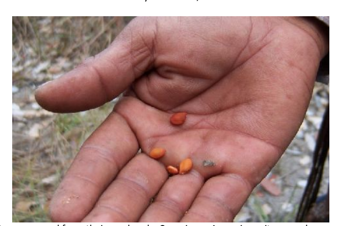
Once removed from their seed pods, Congrio or Acosmium nitens seeds are not much bigger than apple seeds, but require soaking for 24 hours to germinate.

Dexter B. Dombro is one of the founders of <u>Amazonia Reforestation</u>, <u>CO2 Tropical Trees</u> and of the <u>Reserva Natural La Pedregoza</u> in Vichada, Colombia. La Pedregoza is one of the featured plantations within <u>Tree-Nation</u>. Dexter is a member of the <u>IUCN's</u> World Commission on Protected Areas and is dedicated to biodiversity conservation in the Orinoco River basin. The plantation was founded in 2007.