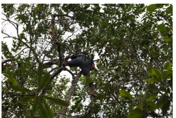
Bertoldo climbing way up in a Salivón tree at La Pedregoza

Due to our wet and dry seasons we are able to collect most of our native tree seeds in the second half of the dry season and the early part of the wet season. Most trees flower in the first half of the dry season, so the best time for us to collect most native tree seeds is predictable. This does not mean it is an easy process. Monkeys, macaws, parrots and ants compete with us for the fruits and seeds of several trees that are on the endangered list. Once the rains start we experience flooding in the rainforest, with seeds falling into the water and washing away. Climbing the trees can be dangerous, as many seeds can only be found high in the rainforest canopy. This makes the seed collection process expensive, time consuming and often disappointing when seeds have already been lost.