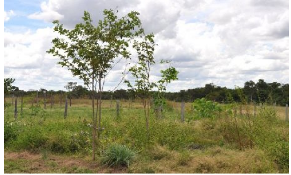
Young Congrio trees in experimental plot with well-drained soil.

Our <u>Amazonia Reforestation</u> and <u>CO2 Tropical Trees</u> programs at La Pedregoza are based on a desire to preserve biodiversity on our planet. Some 90% of terrestrial biodiversity lives in forests. Many of those animals are niche dependent, for example everyone learns in school about Koala bears needing eucalyptus trees and giant Pandas depending on bamboo forests. At La Pedregoza we have birds, amphibians and mammals that depend on certain types of native trees for food, shelter and nesting areas. Planting native tree species soon became not just an objective for our reforestation efforts and for our <u>Reserva Natural La Pedregoza</u>, but a passion.