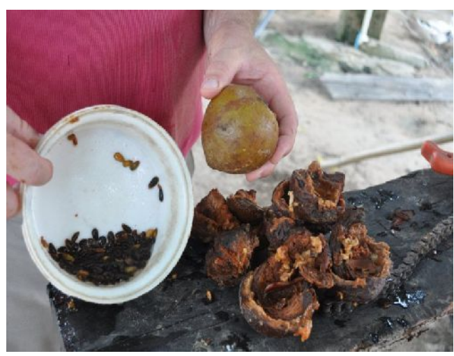
Extracting the seeds of the latex producing Salivón or Pendare tree ( Parahancornia oblonga ) is not easy, as the monkeys often beat us to the sickly sweet and orange-sized fruits that contain the seeds. The fruits are edible by humans, but are almost impossible to collect high up in the rainforest canopy. They start to ferment before they fall to the ground.