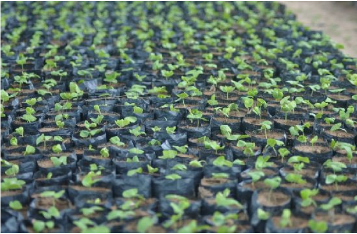
Saladillo blanco ( Vochysia obscura ) seedlings in planting bags at the La Pedregoza tree nursery in Vichada, Colombia.

Our long term goal to become a seed bank for native tree species is shared with the <u>Omacha Foundation</u> and with Europe's <u>Tree-Nation</u>. Our common goal is to conserve species that are endangered, vulnerable or threatened. It is our believe that if we can commercialize those species, by providing access to seeds, germination and planting instructions and information on growth expectations and carbon sequestration, then other plantations will start to cultivate these species. That will reduce or remove the pressure those species experience in natural forests, reduce illegal logging and allow for the species to recover over time. Commercializing a species may appear to some to be an unwelcome development, but it is a process that is most likely to prevent a species' extinction and to have an impact on maintaining and conserving biodiversity.