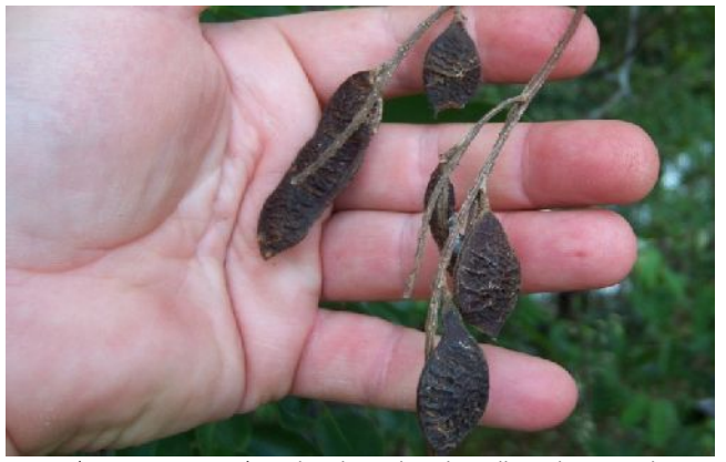
Congrio (Acosmium nitens) seed pods ready to be collected at La Pedregoza.