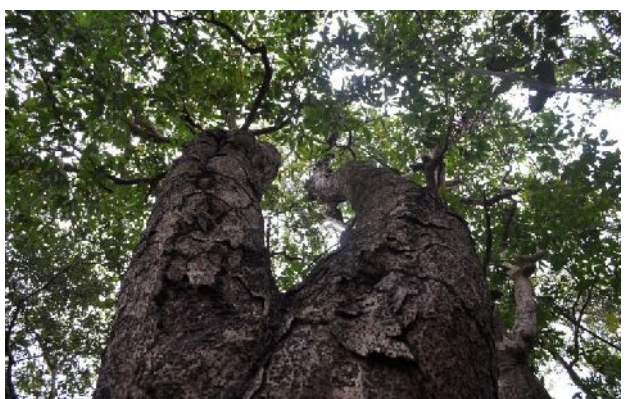
Endangered Ocotea cymbarum tree. How do we get up there?

Reforestation and afforestation often involves planting trees that have a proven history of commercial success, fast growth and ease of cultivation. This copies the same pattern that has seen biodiversity in crops decline around the world, as most agriculture revolves around a limited number of species. At La Pedregoza one of our objectives is to practice multispecies cultivation that includes native trees. The importance of this is obvious when one visits large teak plantations in Costa Rica, as they are usually devoid of insects, birds and local wildlife, because teak is a tree from south Asia that is not part of local niche habitats.