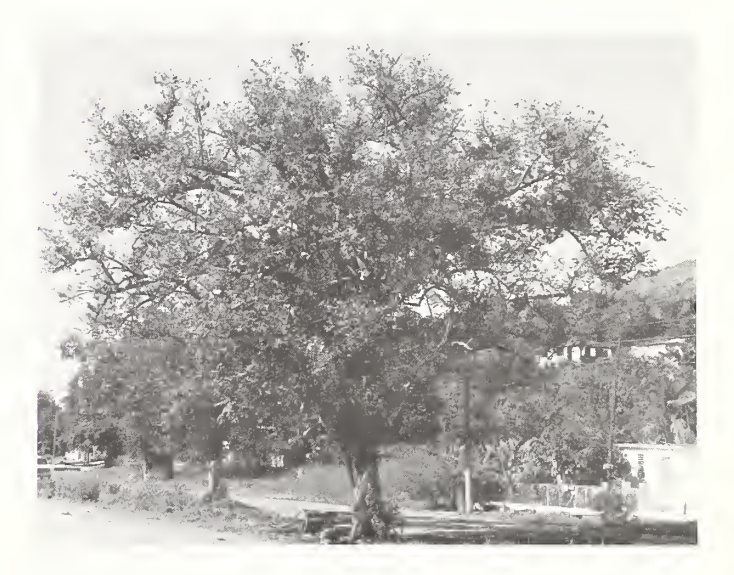
Figure 1.—A guácima (Guazuma ulmifolia) tree growing in Puerto Rico.

Successional stages of the semideciduous forests in Jalisco, Mexico, may include guácima associated with Acrocomia mexicana Karw. ex Mart., Casearia parvifolia Willd., Castilla elastica Cervantes, Cochlospermum vitifolium (Willd.) Spreng., Cyrtocarpa procera H.B.K., Forchhammeria pallida Liebm., Heliocarpus spp., Luehea candida Mart., Lysiloma acapulcensis (Kunth) Benth., Piptadenia sp., Spondias purpurea L., Thouinia sp., Trema micrantha (L.) Blume, and Xylosma flexuosum Hemsl. (31). Abandoned fields in coastal valleys of Guanacaste Province, Costa Rica, support successional trees, such as Castilla elastica, Cecropia peltata L., Cochlospermum vitifolium, and Mutingia calabura L., along with guácima (9). Limestone hills with shallow soils in the