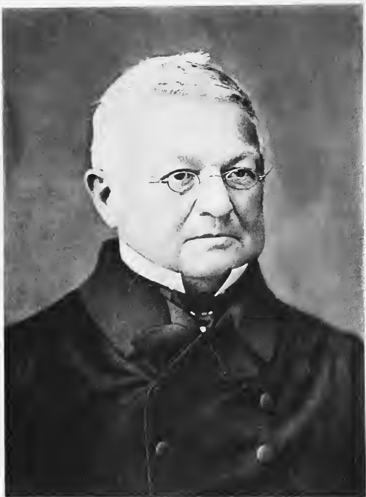
Adolphe Thiers. First President of the Third Republic