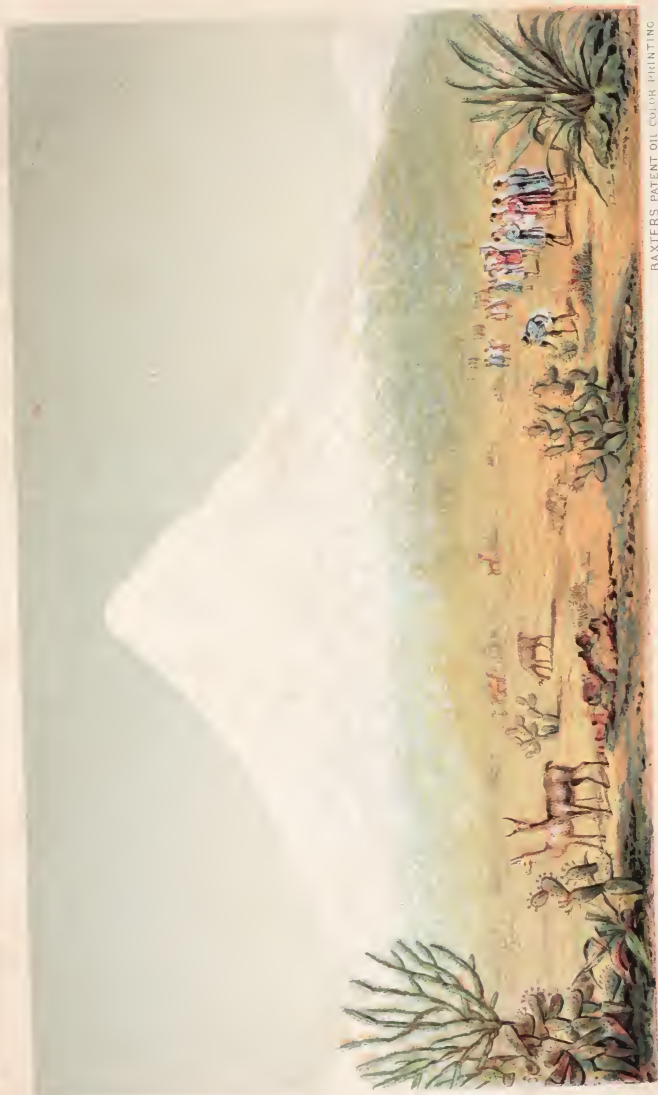
BAXTERS PATENT OIL COLOR PRINTING XI. NORTHAMPTON SQUARE