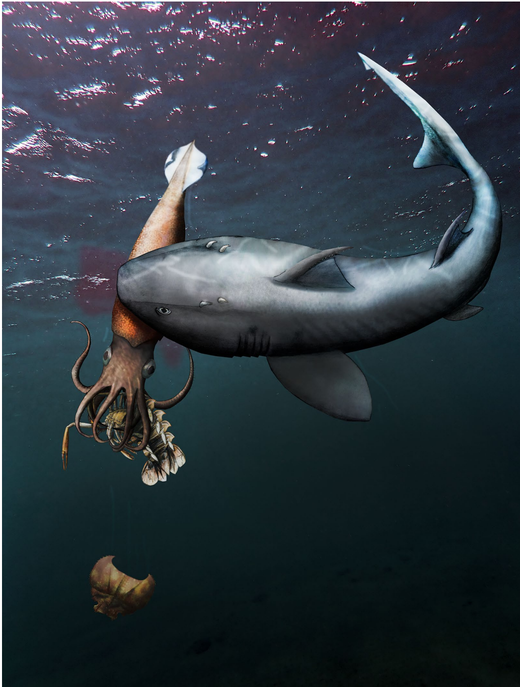
Fig. 3 Possible scenario explaining the taphonomy of the belemnite. Hybodus hauffianus is known to have fed on belemnites, although it is unclear whether some individuals learned how to avoid the swallowing of the calcitic rostrum. The belemnite Passaloteuthis laevigata holds remains of the exuvia of Proeryon in its arms

Additionally, we use this occasion to introduce the term leftover fall for such remains of a meal and pabulite for the fossilized remains of which. Diverse pabulites have been reported before. They are valuable sources of palaeobiological information and deserve more attention.